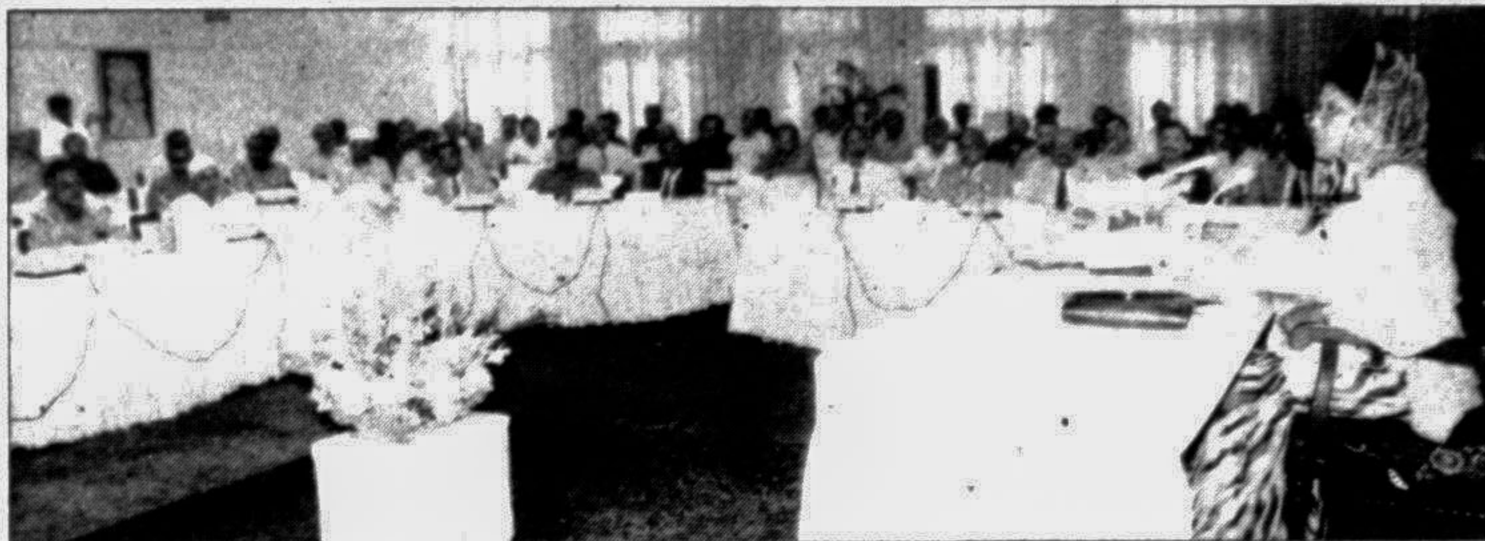
Prime Minister Begum Khaleida Zia presiding over the National Economic Council meeting in the city yesterday.

In reply to a question, he said Bangladesh meets international standard aviation guidelines.