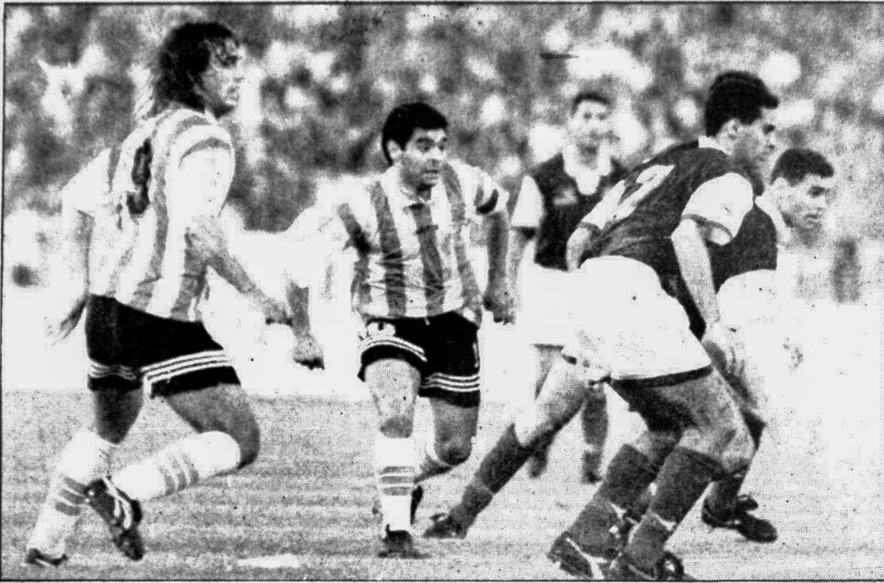
Argentine soccer star Diego Maradona (C) in action against Israel during a World Cup prep match in Tel Aviv on Tuesday. Argentina won 3-0.