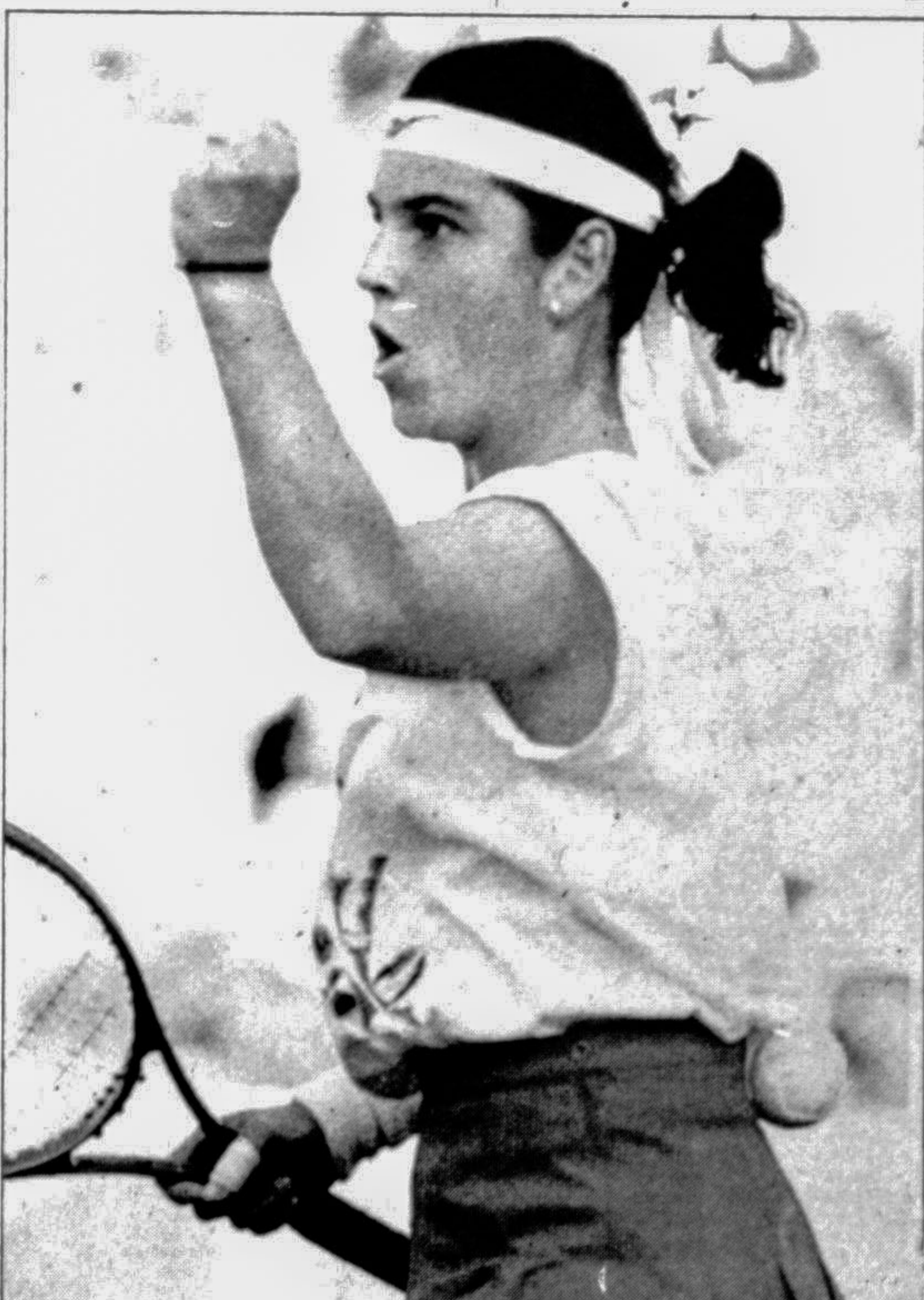
Spaniard Arantxa Sanchez Vicario exults after beating France's Julie Halard in the quarter-finals of the French Open in Paris on Tuesday. Arantxa won 6-1, 7-6 (8-6).

NOTTINGHAM, England, June 1: England captain Mike Atherton was named as his country's player-of-the-year on Tuesday, and then pledged to score more Test hundreds in the coming 12 months, reports Reuter. Atherton emerged from the recent series in West Indies with 510 runs at an average of 56.44 to follow his 553 runs at 46.08 in last season's Ashes Tests.