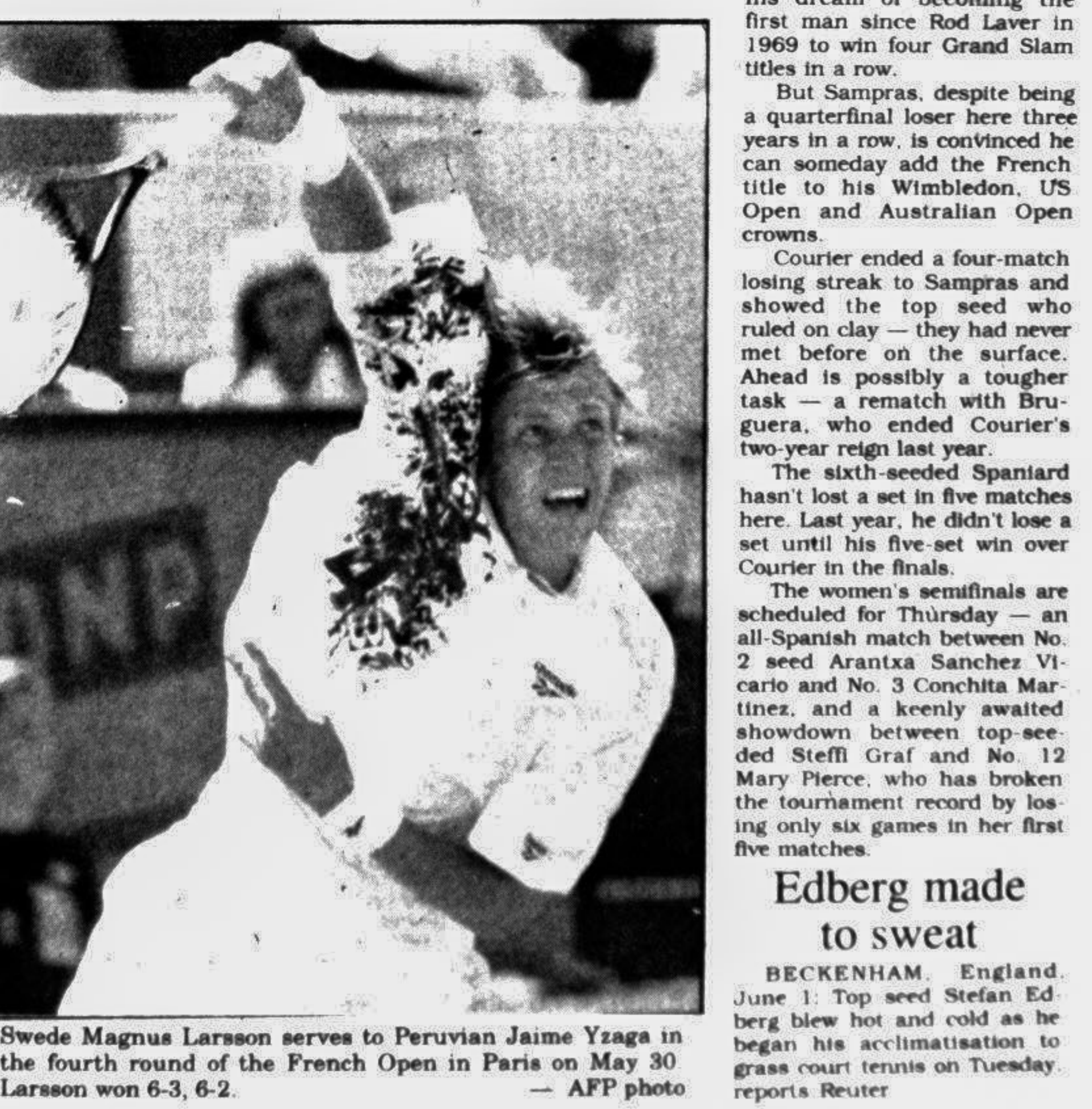
Swede Magnus Larsson serves to Peruvian Jaime Yzaga in the fourth round of the French Open in Paris on May 30. Larsson won 6-3, 6-2.