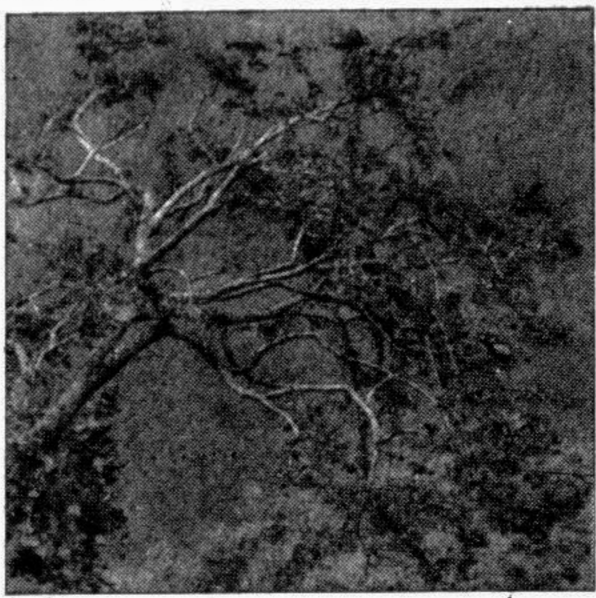
Majestic Krishnachura in bloom.

Every major city has a landmark it is proud of. And Dhaka till the mid-seventies could be justly proud of its magnificent Krishnachura, a riot of flame orange from the present-day Sheraton Hotel, right past the Radio Office up to the Police Station at Ramna. A walk down