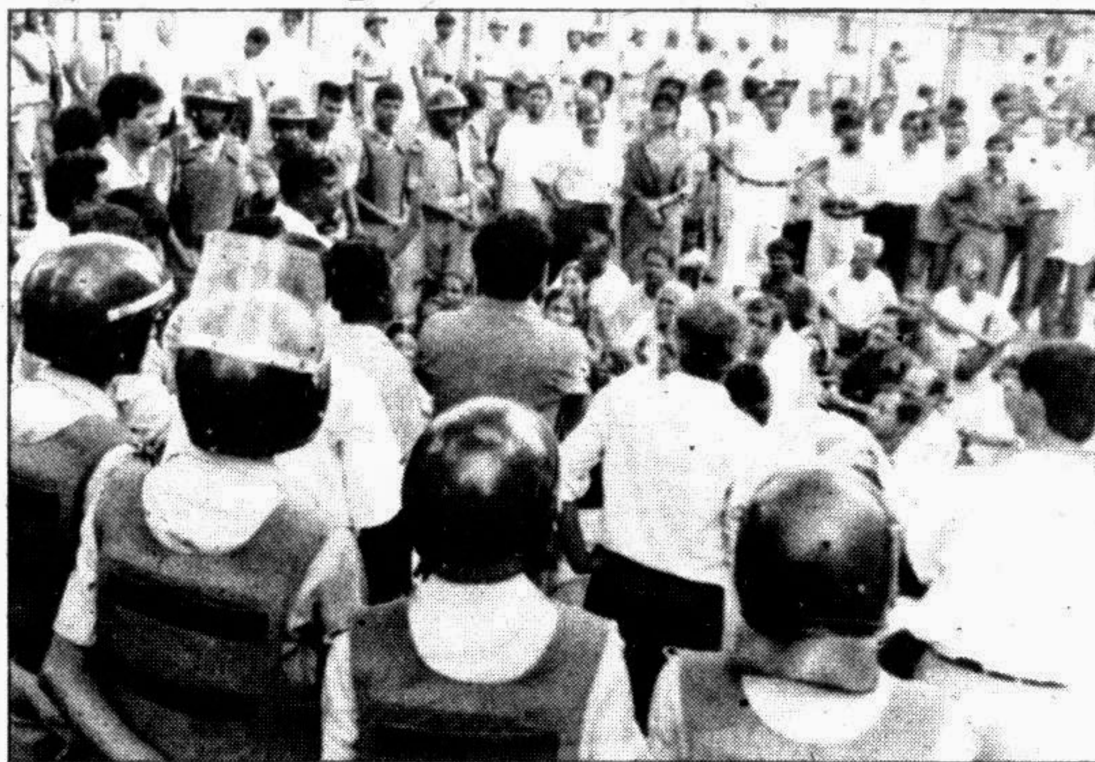
The liaison committee of the striking teachers staged a sit-in in front of the Dhaka Secondary and Higher Secondary Education Board in the city yesterday.

Wednesday 4:30 Opening announcement Al-Quran Programme summary 4:45 Documentary: World Cup '94 5:10 News in Bangla 5:20 Children's programme: Amra Natun 5:50 Hijaal Taimal 6:50 Open University 7:20 Tagore song 8:00 News in Bangla 8:30 Dance programme 9:05 Film show: The A-Team 10:00 News in English 10:30 Ujjiban 11:30 Khabar/The News 11:45 Closing