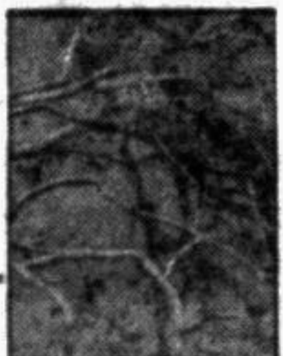
Proud but Lonely Krishna Chandra Page 3