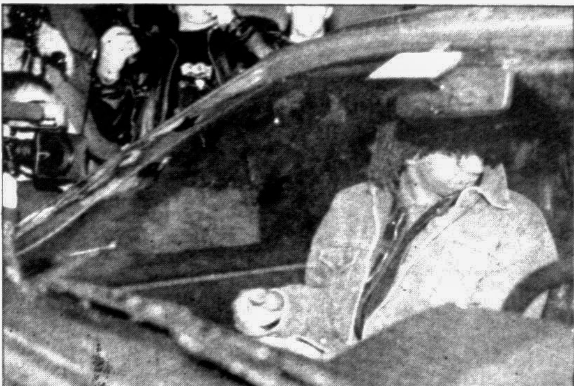
Dutch international Ruud Gullit leaves hurriedly in a car, surrounded by photographers, after holding a press conference in Noordwijk, the Netherlands yesterday to announce that he walked out on the national team and will not play in next month's World Cup finals in the United States.

Warwickshire survived the shock to beat Middlesex by three wickets and move to second place in the league behind Surrey.