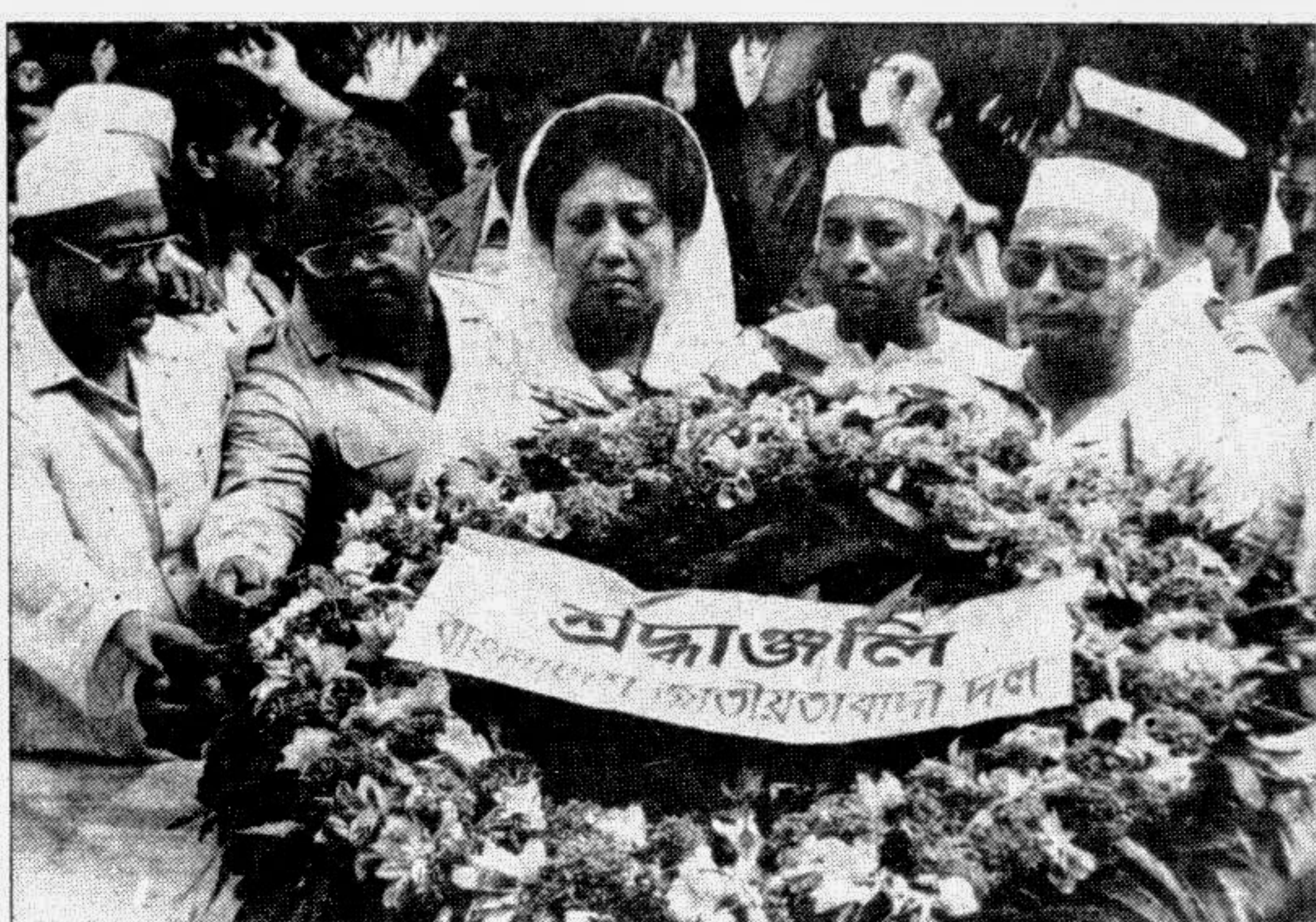
BNP Chairperson and Prime Minister Begum Khaleda Zia, along with her cabinet colleagues, placing wreaths at the mazar of Shaheed President Ziaur Rahman on the occasion of his 13th death anniversary yesterday.

Many NJP members have been demanding that Hosokawa step down as party head.