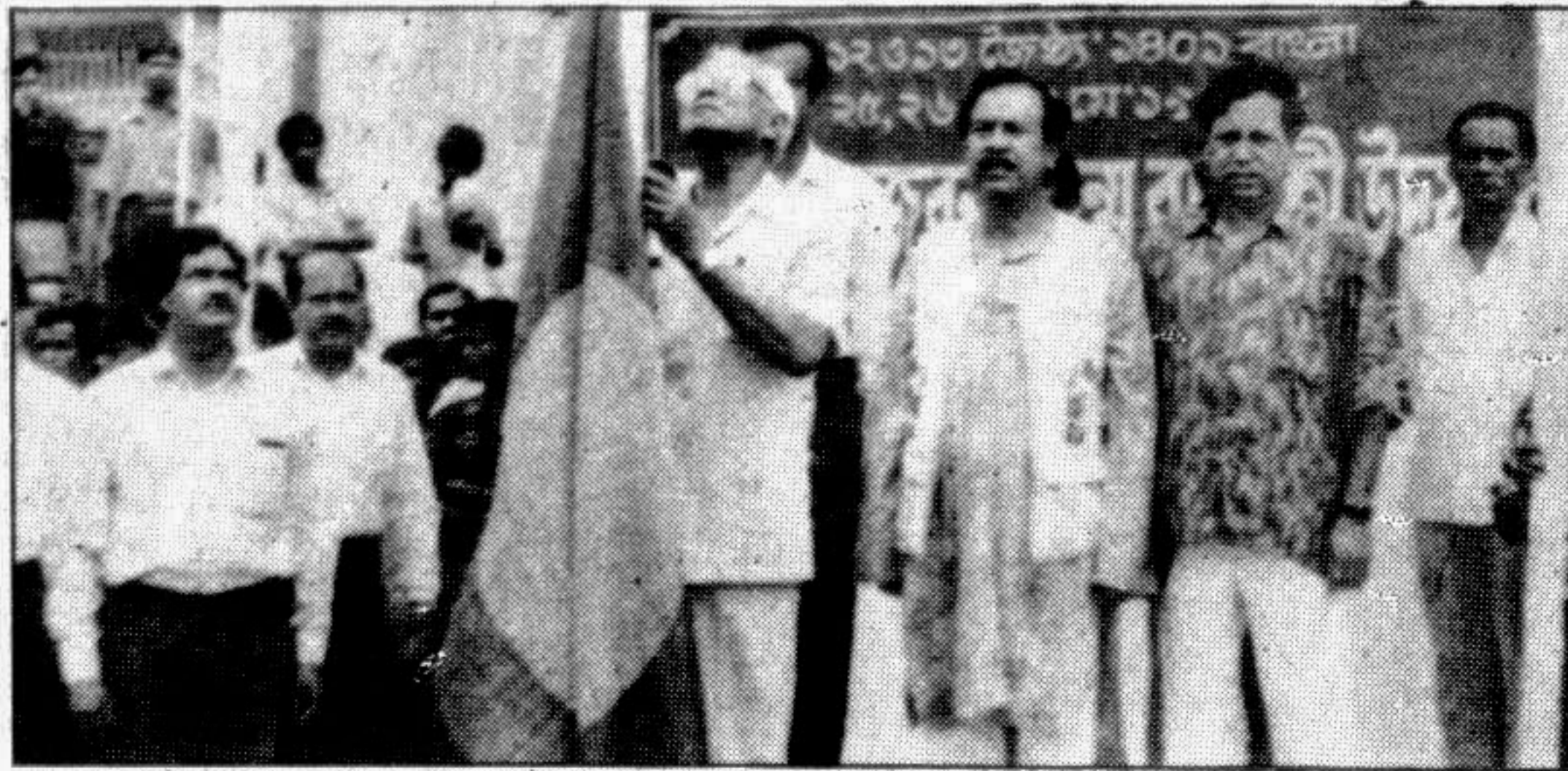
COMILLA: On the occasion of the 95th birth anniversary of national poet Kazi Nazrul Islam a three-day long programme was inaugurated. Agriculture Irrigation & Flood Control Minister M Majid-ul-Haq inaugurated the programme by hoisting national flag at Comilla Town Hall. Environment Minister Akbar Hossain see beside him.

Barguna Zila Sadar Hospital meant for rendering improved medicare to rural people has long been groaning under manifold problems including shortage of beds, doctors, consultants, essential drugs and absence of blood bank, modern surgical apparatus and other essential appliances.