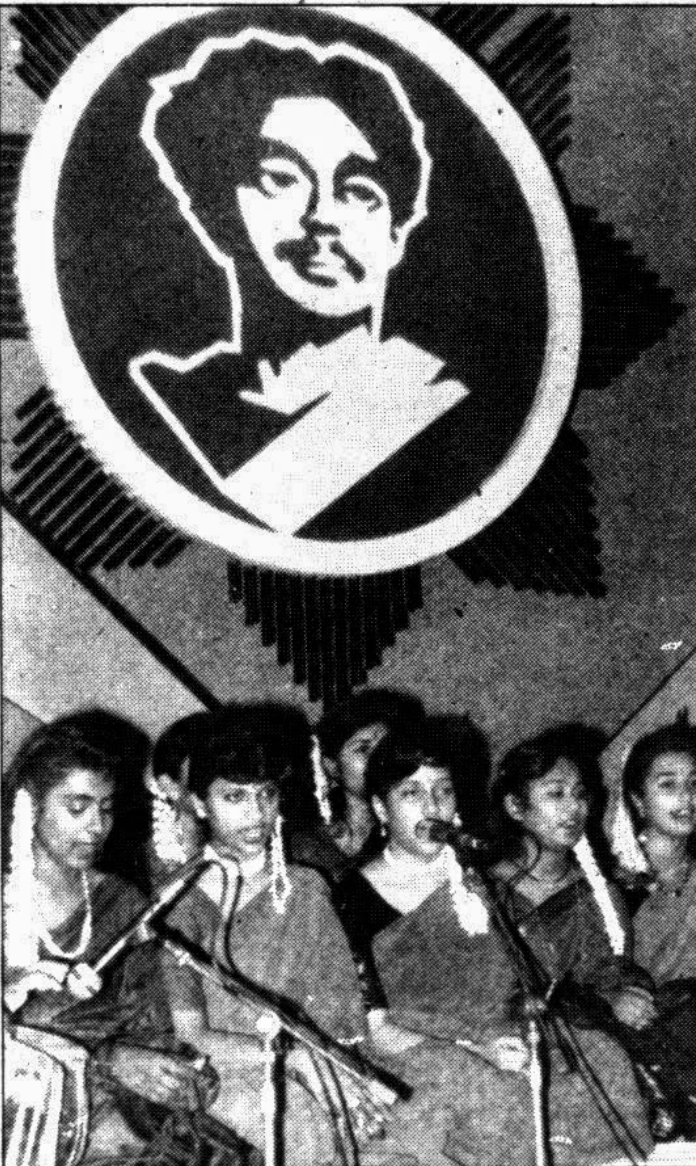
Members of Hindal, a cultural organisation, presenting songs at the Shilpakala Academy auditorium in the city yesterday as part of the 95th birth anniversary celebrations of National Poet Kazi Nazrul Islam.

The working sessions of the workshop will be participated by senior government officials, policy makers, educationists and representative of development partners.