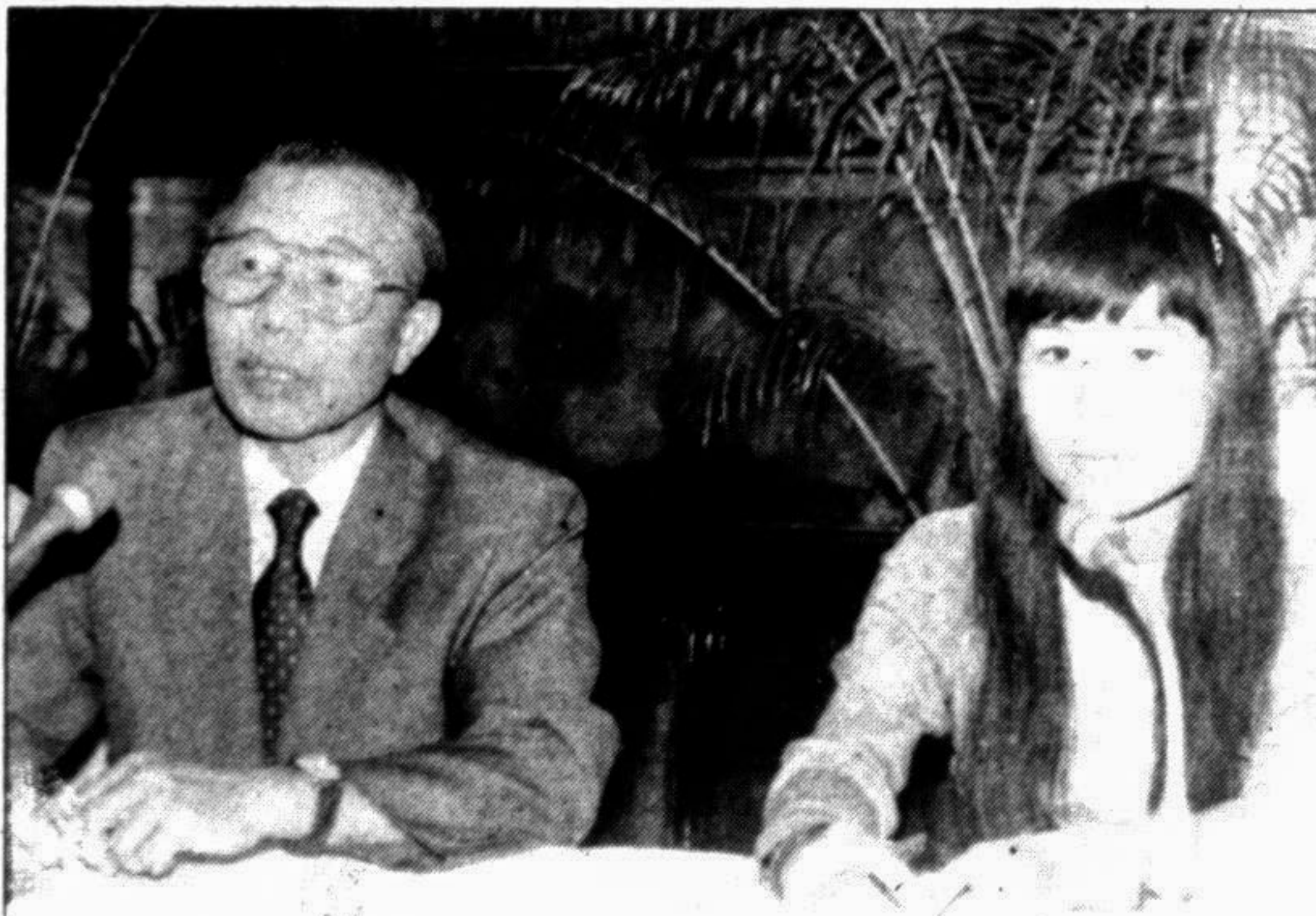
Vietnamese Foreign Minister Nguyen Manh Cam (L) addressing a press conference at the state guest house Padma in the city yesterday (story on page 1).

The Vietnamese foreign minister appreciated Bangladesh's position on the issue.