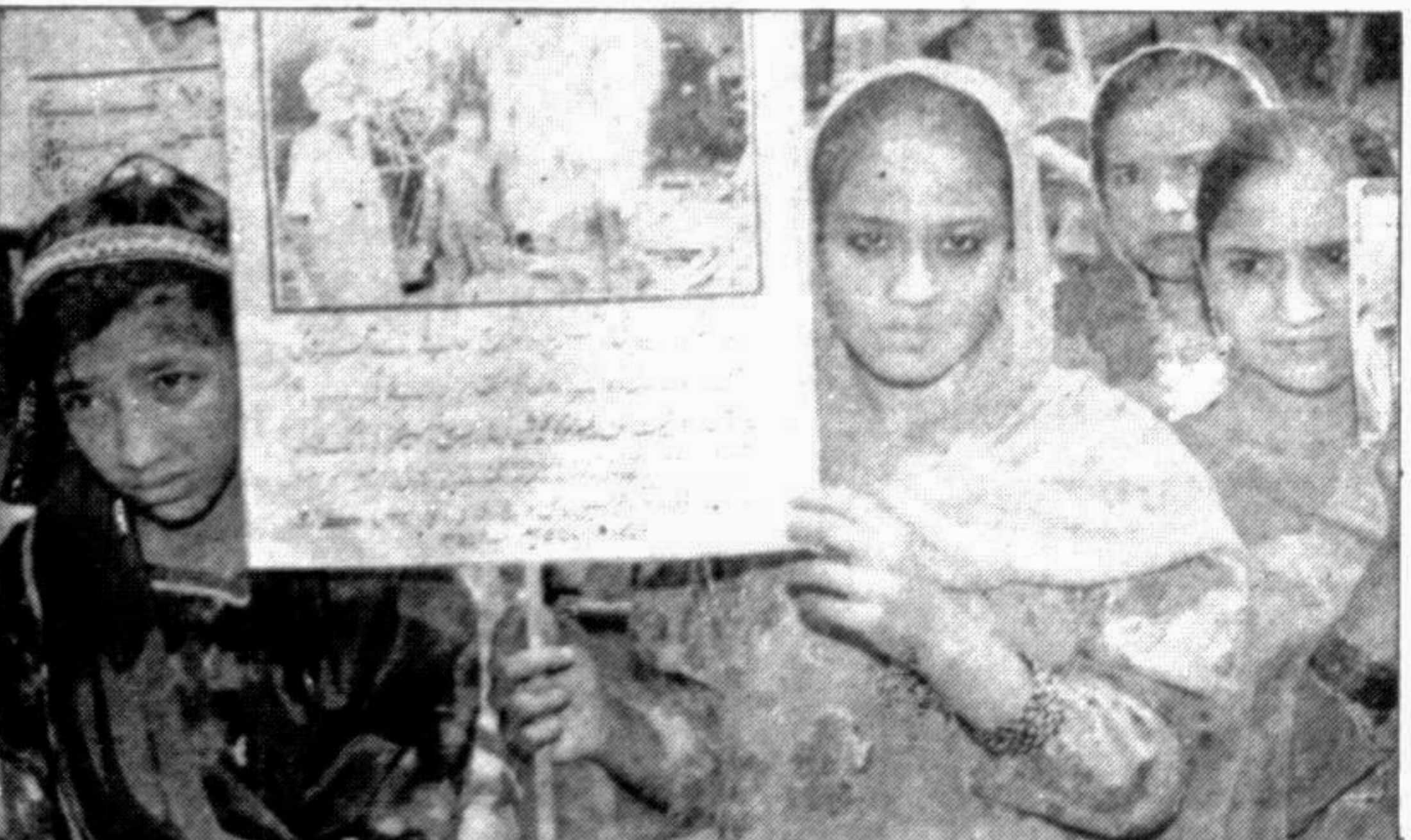
A teenaged girl holds a placard denouncing growing child labour in Pakistan during a protest rally in Karachi yesterday. A study says, some eight million children are forced to work in factories, particularly in the carpet industry in Pakistan.

A discussion meeting will be held on June 2 at 4 pm at the National Museum auditorium under the auspices of the BNP.