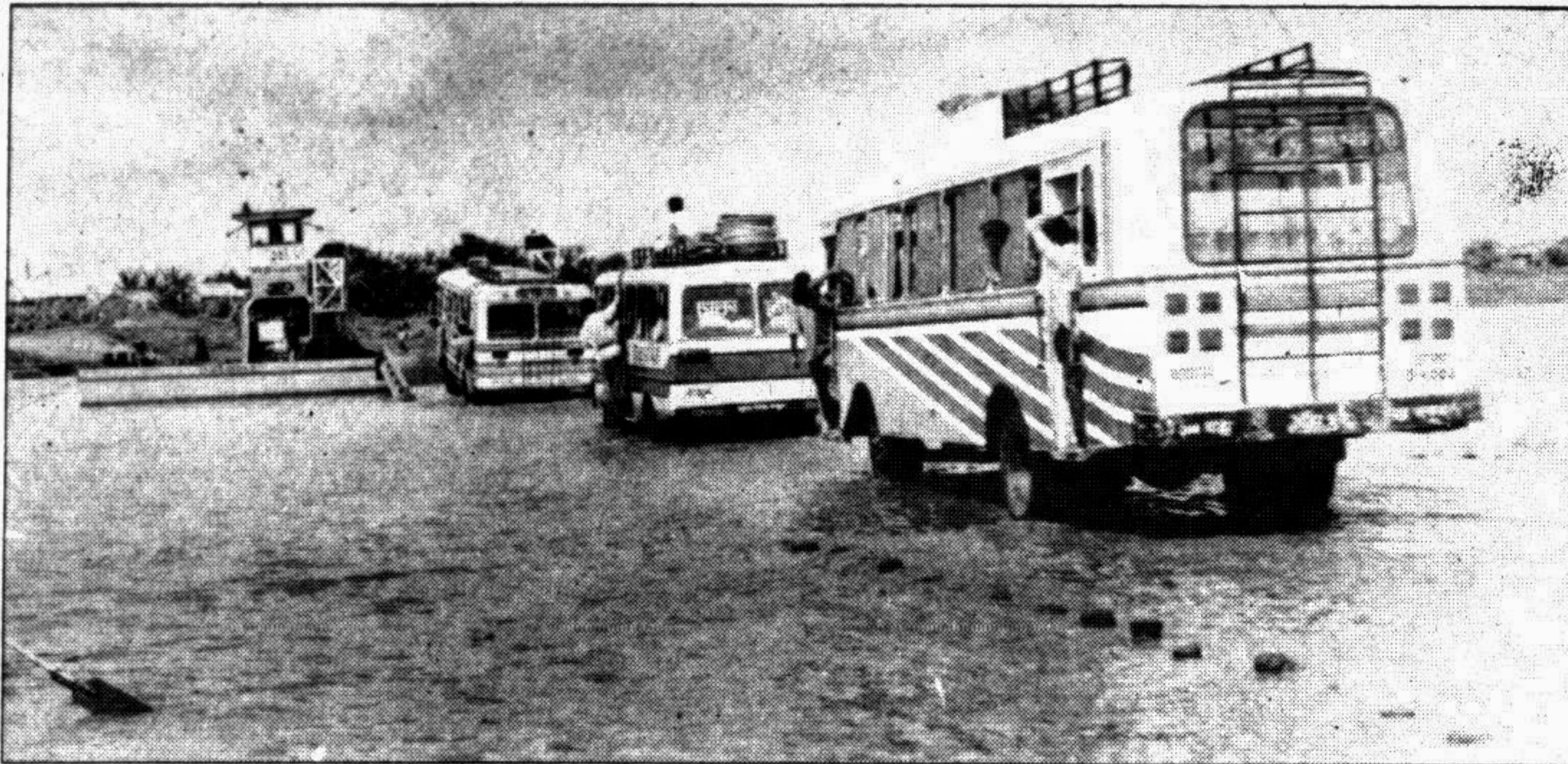
The Dhaleswari river in spate following heavy rainfall over the past few days has inundated the approach road to a ferry ghat — Dhaleswari One — on the Dhaka-Mawa Highway yesterday rendering loading and unloading of vehicles perilous.