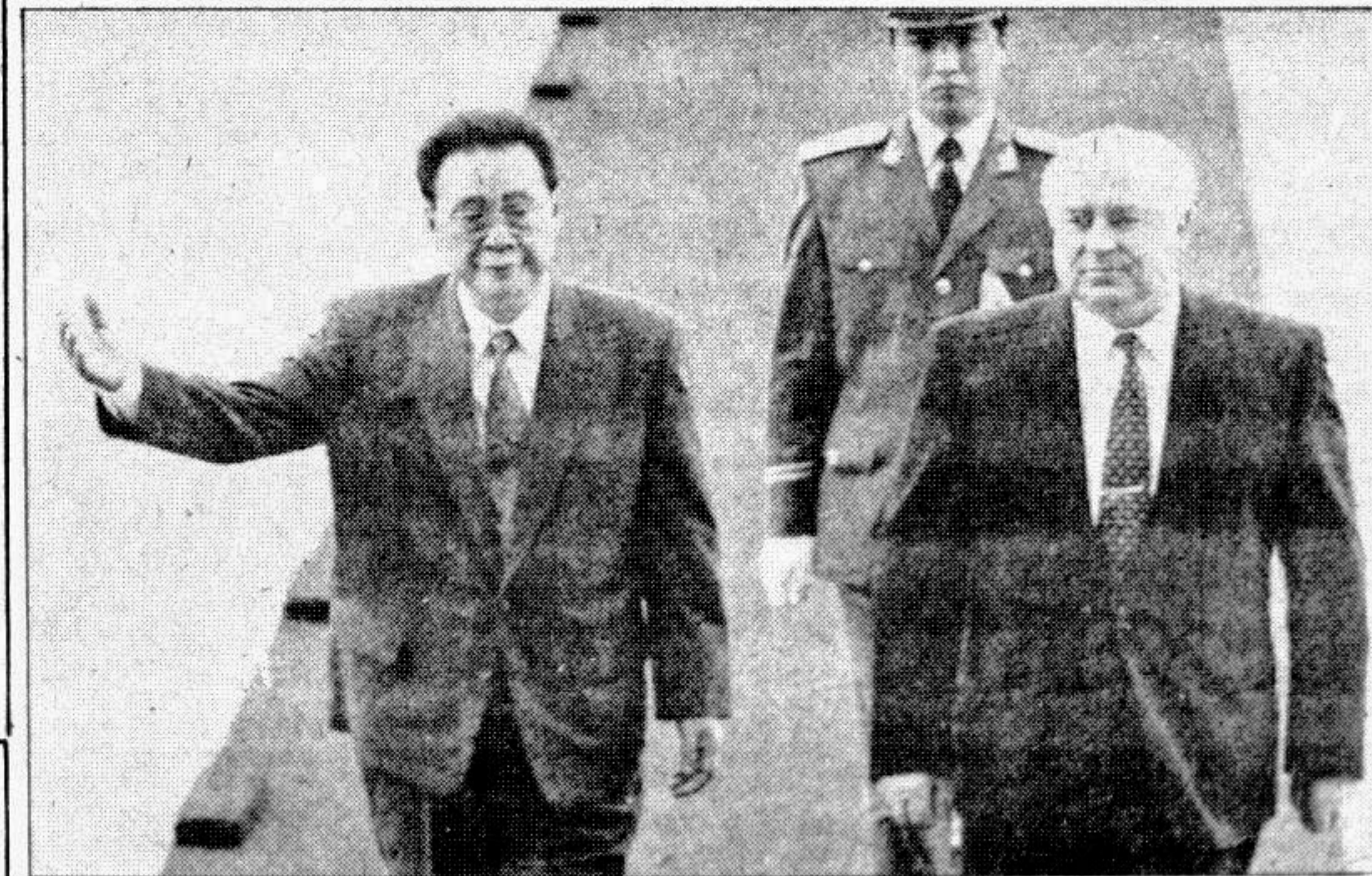
Chinese Premier Li Peng accompanies his Russian counterpart Viktor Chernomyrdin (R) during the welcoming ceremony at the Great Hall of the People in Beijing yesterday.

Deputy Leader of the Opposition Abdus Samad Azad called on Bhutanese King Zigme Singhe Wangchuck during his recent visit to Timpu and conveyed Sheikh Hasina's greetings to the King, reports UNB. Azad went to Bhutan on May 18 at the invitation of its Foreign Minister Dawa Tsering. The Bhutanese King recalled the contribution of Bangabandhu Sheikh Mujibur Rahman to the War of Liberation. The King lauded the heroic role of the people of Bangladesh in the Liberation War. Azad also had an exclusive meeting with Bhutanese Foreign Minister Dawa Tsering. They exchanged views on political, social and economic issues of the two countries.