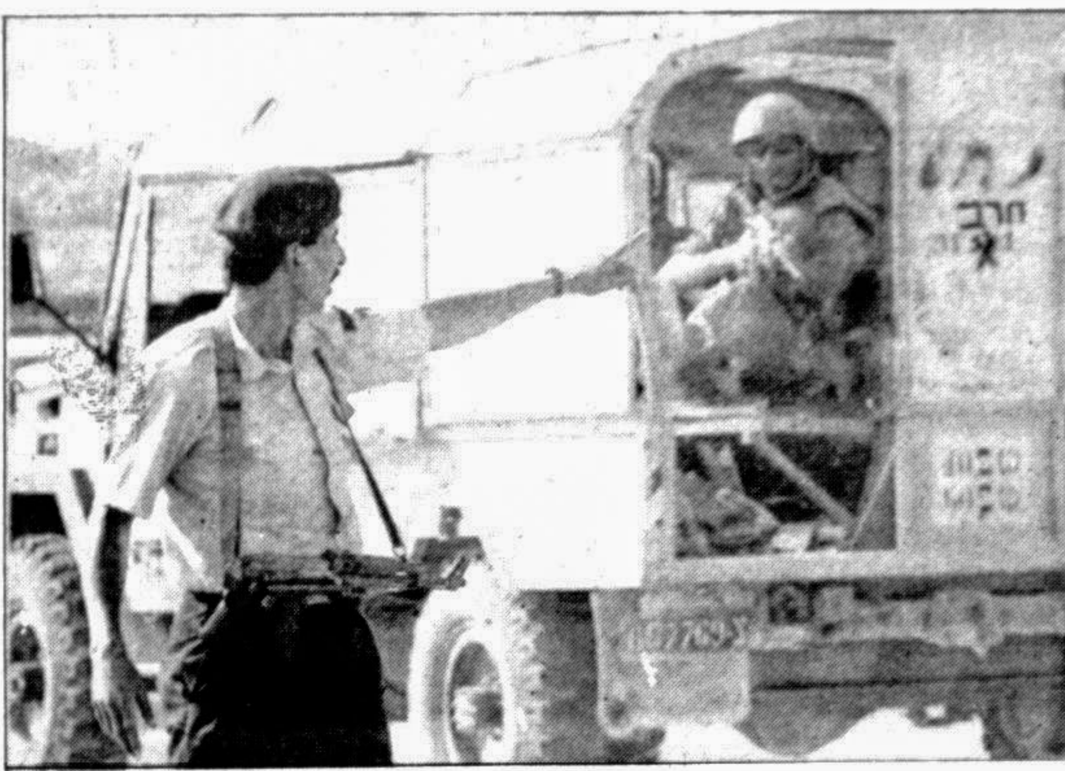
A Palestinian policeman orders an Israeli soldier to lower the barrel of his gun while passing a road block manned by the new Palestinian authority, in the Gaza Strip Wednesday.

WASHINGTON, May 26: The SAARC finance ministers are likely to meet in Bangladesh on July 9 and 10 to formulate a strategy to accelerate poverty reduction programmes in the SAARC region, Bangladesh Finance Minister M Saifur Rahman said here today, reports BSS.