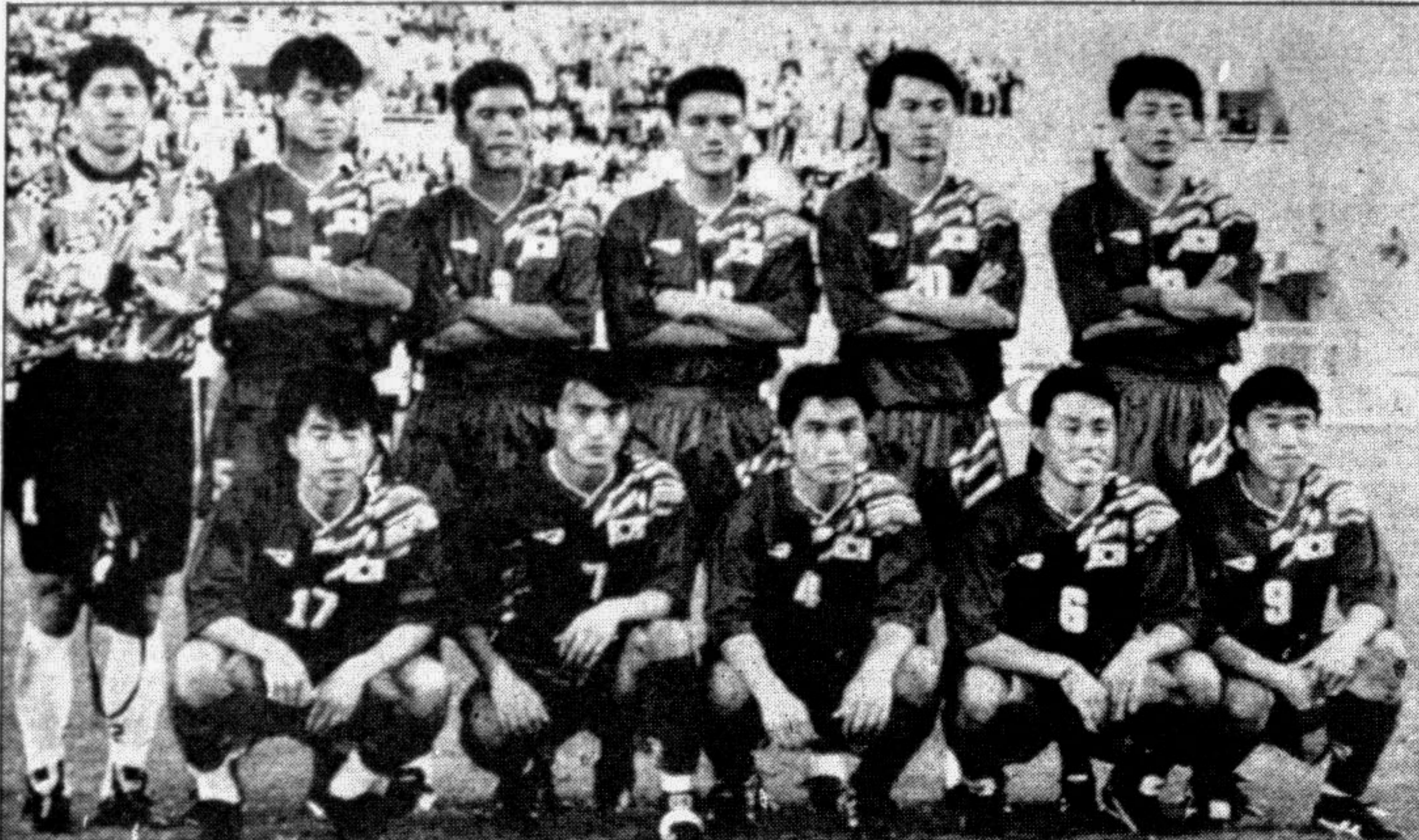
An undated photo of the South Korean national squad. This will be their fourth successive appearance in the World Cup finals. They will hope to improve upon their dismal record of not getting past the first round during next month's finals in the USA.