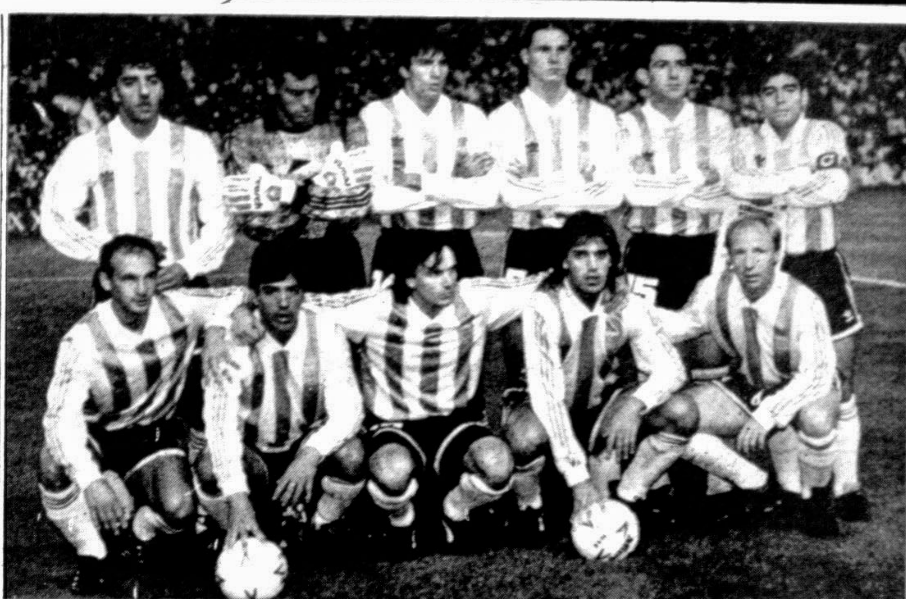
An AFP undated file photo shows the Argentine national squad. Labelled by critics as the villains of the 1990 World Cup, they will aim to set the record straight in this year's finals in the United States.

CRYPTOQUIP M D U W K D U A C K K A U V C G D G R M K D U S C Z V C G D Z U K D L L B U T , D U B W U M D U M R G V C W - C G D U T . Saturday's Cryptoquip: I ONLY ATTRIBUTED MY BADLY TORN TROUSERS TO SEAM-STRESS. Today's Cryptoquip clue: V equals F The Cryptoquip is a substitution cipher in which one letter stands for another. If you think that X equals O, it will equal O throughout the puzzle. Single letters, short words and words using an apostrophe give you clues to locating vowels. Solution is by trial and error.