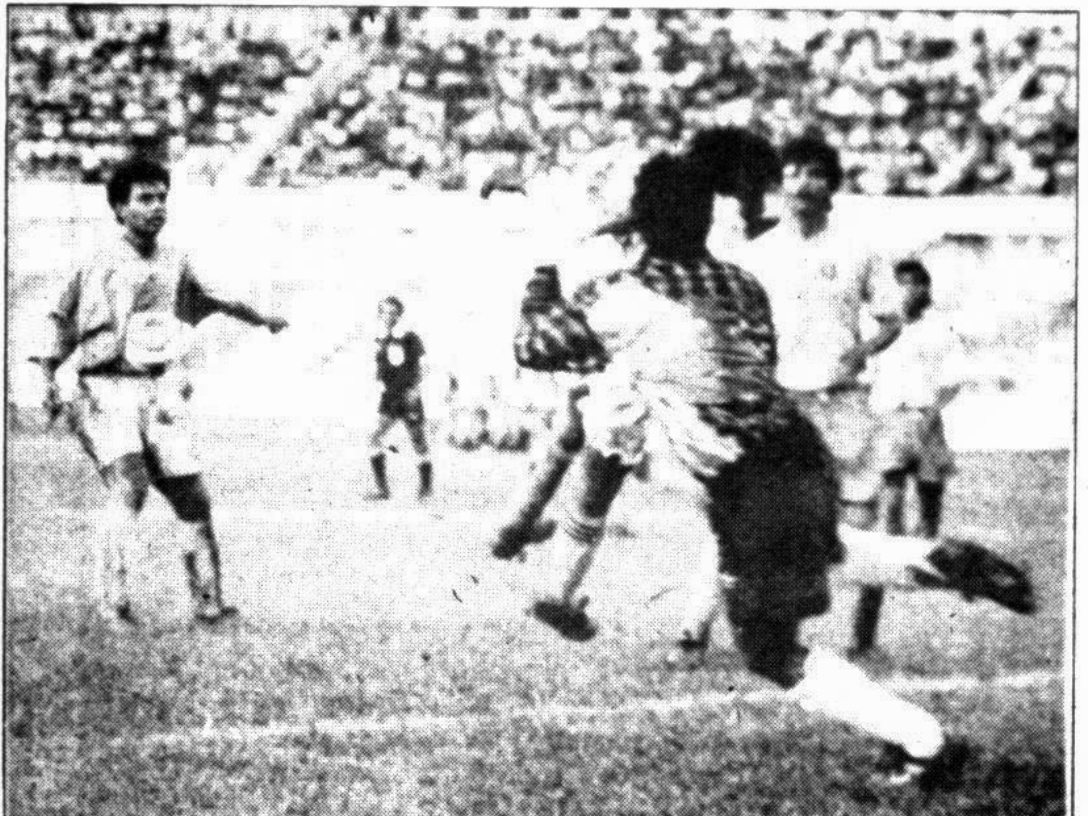
Action from yesterday's DMFA Cup match between Abahani KC and Brothers Union at Dhaka Stadium yesterday. Brothers upset last year's runners-up Abahani 1-0.