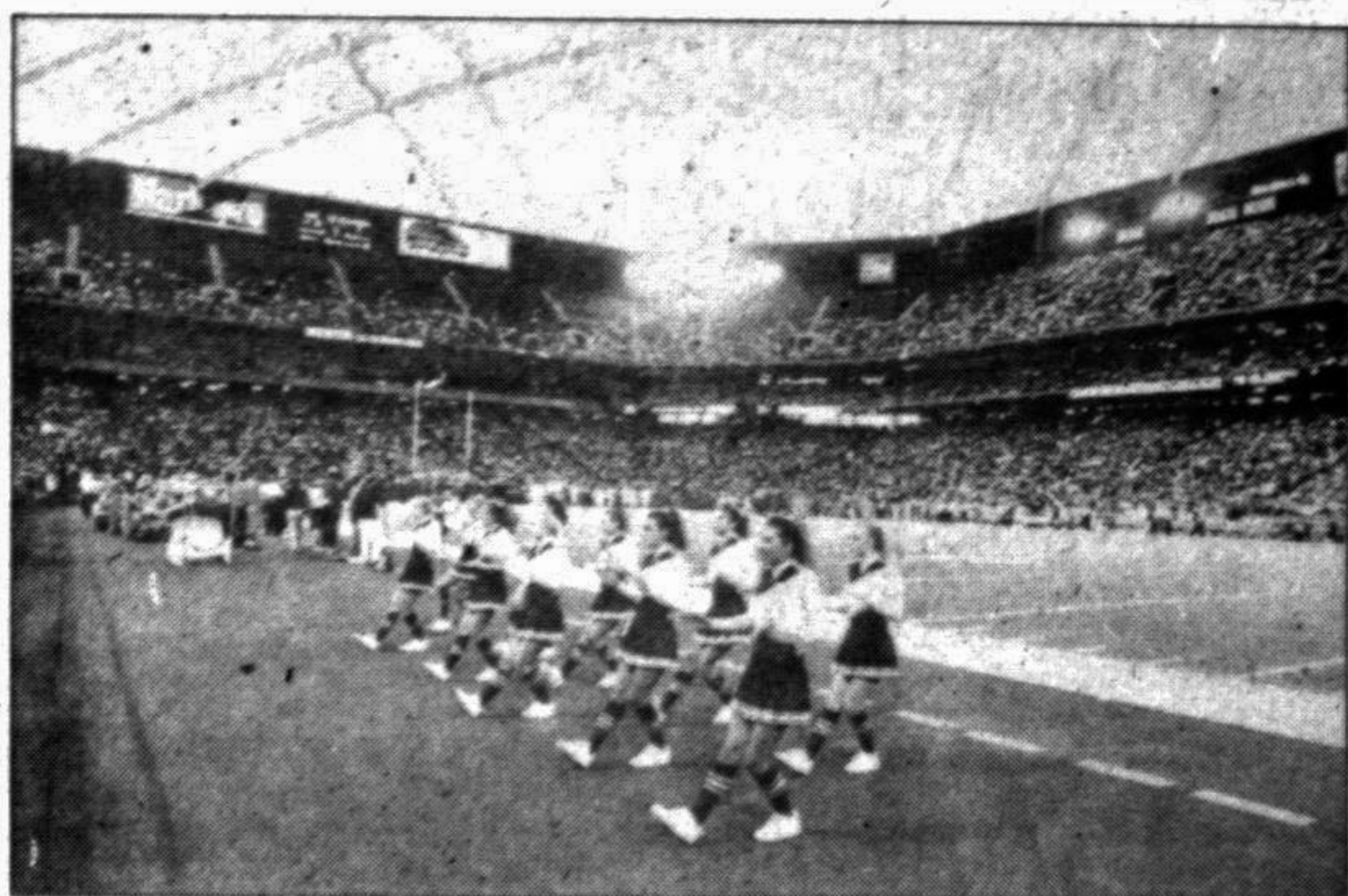
An AFP undated file photo shows the inside of the covered Detroit Silverdome Stadium in Pontiac, Michigan where some first round matches in the 1994 World Cup will be played.

Paceman Danny Morrison confirmed his fitness with nine lively overs, which brought him two for 23 and Dion Nash, his new-ball partner, also picked up two wickets.