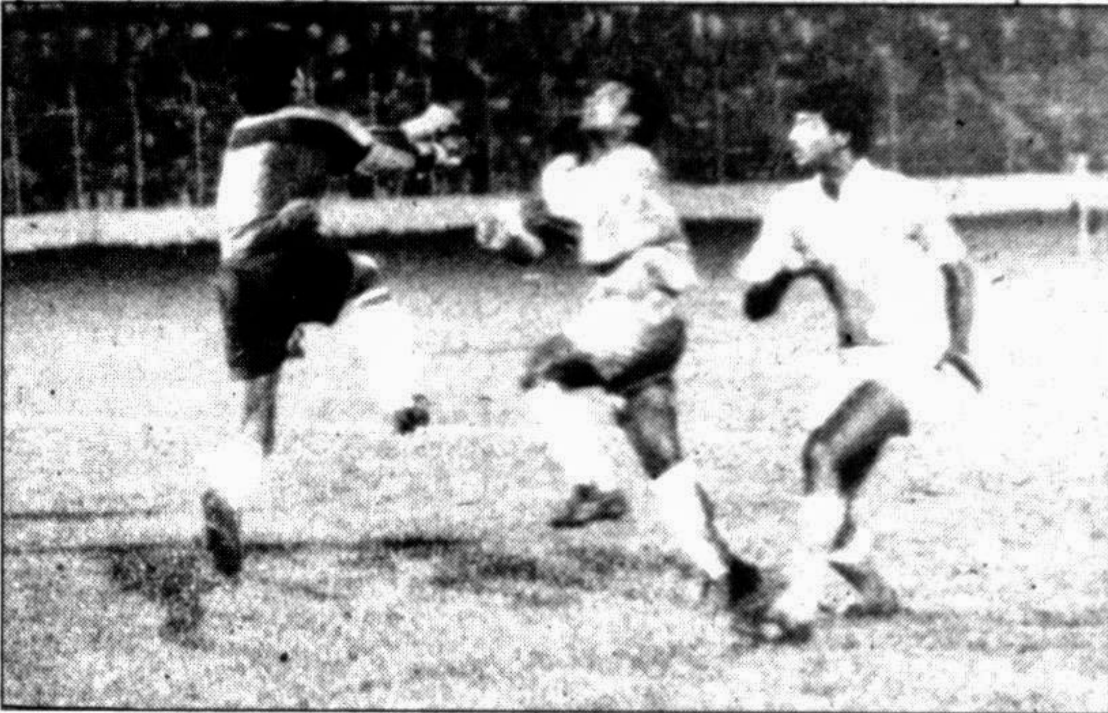
Action from yesterday's second match in the DMFA Cup football tournament between Abahani KC and Farashganj at the Dhaka Stadium. Abahani, last year's runners-up, won 1-0 to reach the last four.

With this tame draw, Brothers' semifinal hopes have