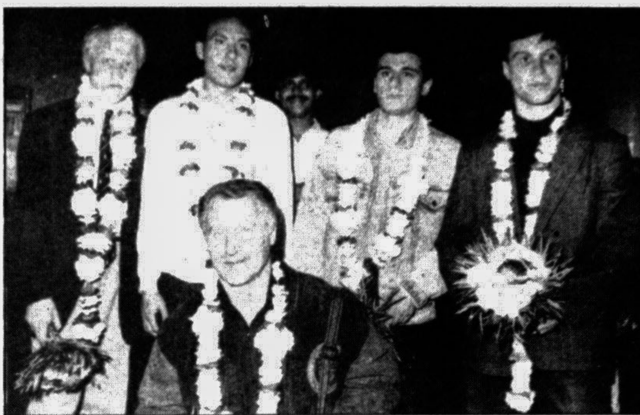
MOHAMMEDANS QUARTET: The four Russian footballers (garlanded, standing) with their negotiator (sitting) pose together at the ZIA on their arrival yesterday afternoon.