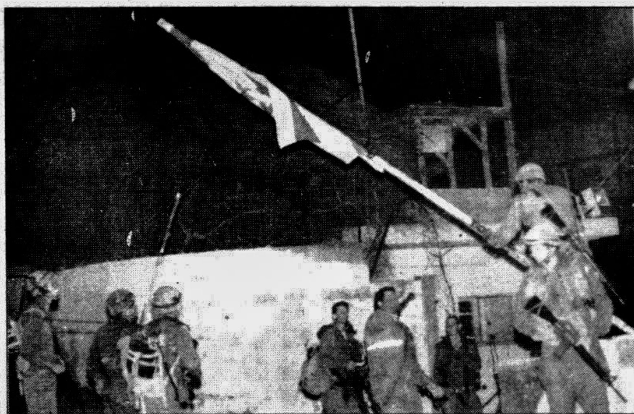
Israeli soldiers taking down the Israeli flag before withdrawing early yesterday from the central prison in Gaza City. Following the departure of the Israeli troops, 150 Palestinian policemen from Egypt took control of the prison.