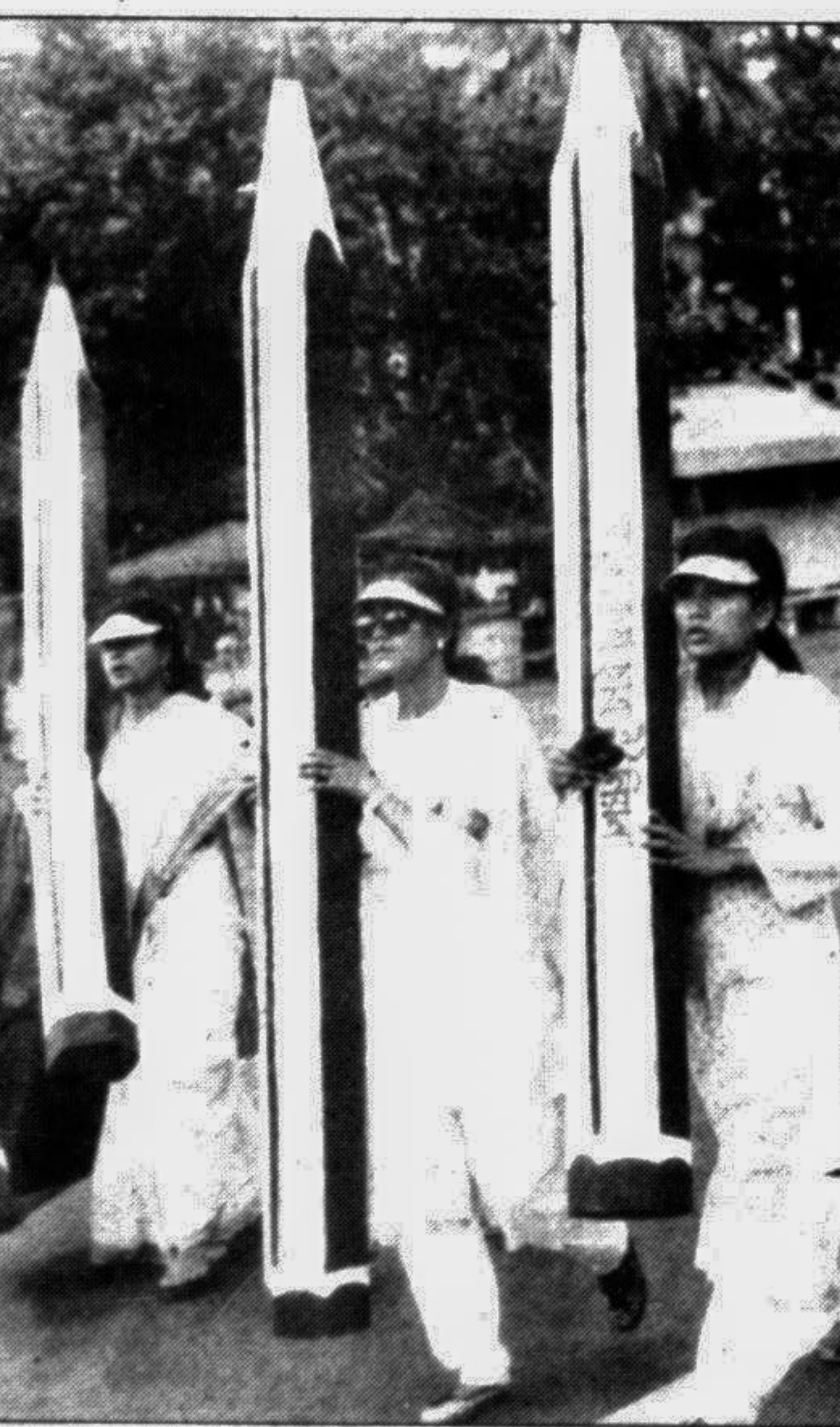
The Bangladesh Chhatra Union held a colourful rally on the occasion of its 23rd national council in the city yesterday.

Rotary Club of Ramna: Regular meeting. Guest Speaker: Prof Golam Mohiuddin of BUET. Subject: GATT — Its implication in Bangladesh. Venue: Hotel Sonargaon. Time: 5:30 pm.