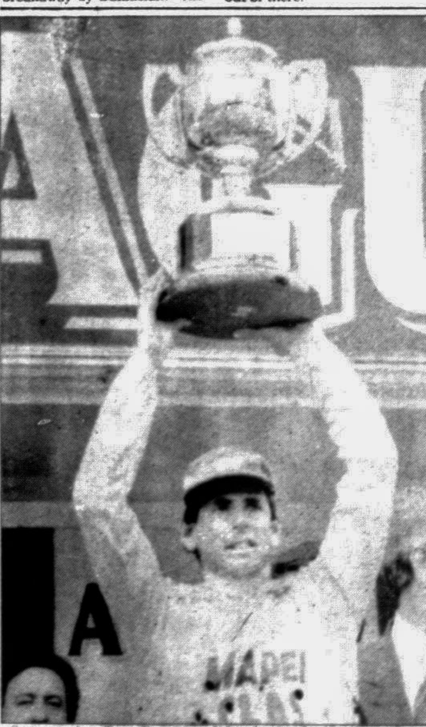
Swiss cyclist Toni Rominger lifts the trophy on the podium after winning the 49th Tour of Spain in Madrid on May 15. Rominger won the tour for the third consecutive year.

"The most important thing for us was that we played with patience," defender Alexi Lalas said. "We waited and waited, got the goal we wanted and got out of there."