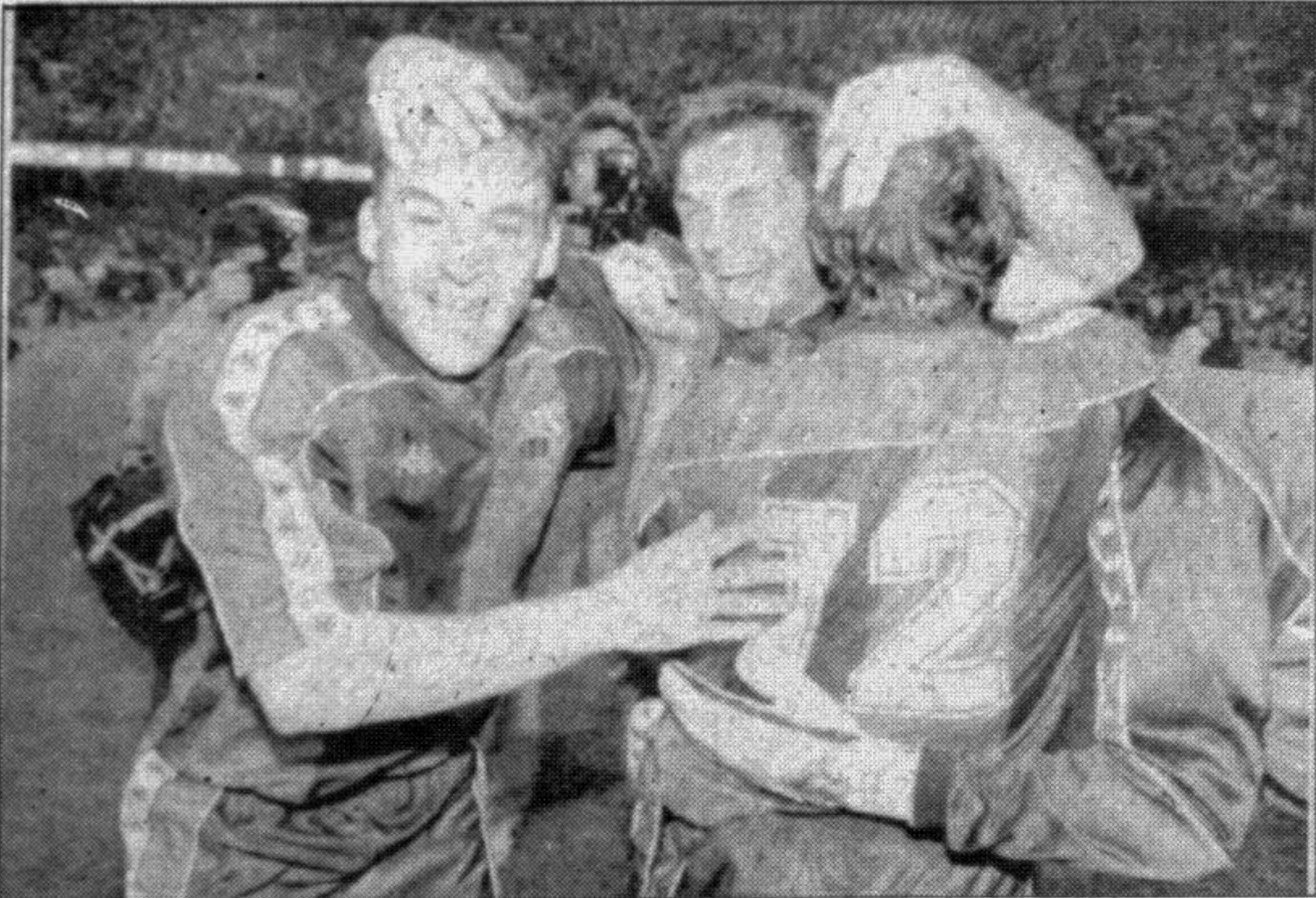
Barcelona players Ferrer (L), Sergi (C) and Goikoetxea (R), celebrate after their team clinched the Spanish league title for a fourth consecutive time on Saturday. Barcelona beat Sevilla 5-2 on the last day of the season.

at home by Valencia, while Barcelona beat Sevilla 5-2 in Nou Camp Stadium.