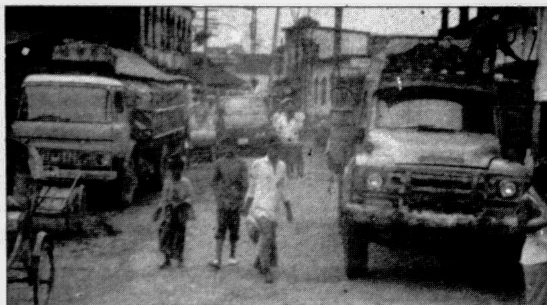
SYLHET: Trucks are often found loading and unloading on the roads blocking traffic movement. These trucks in Kazirbazar area are unloading goods.

Guardians expressed satisfaction at the peaceful holding of the examination and thanked the government for making adequate arrangement of holding examination.