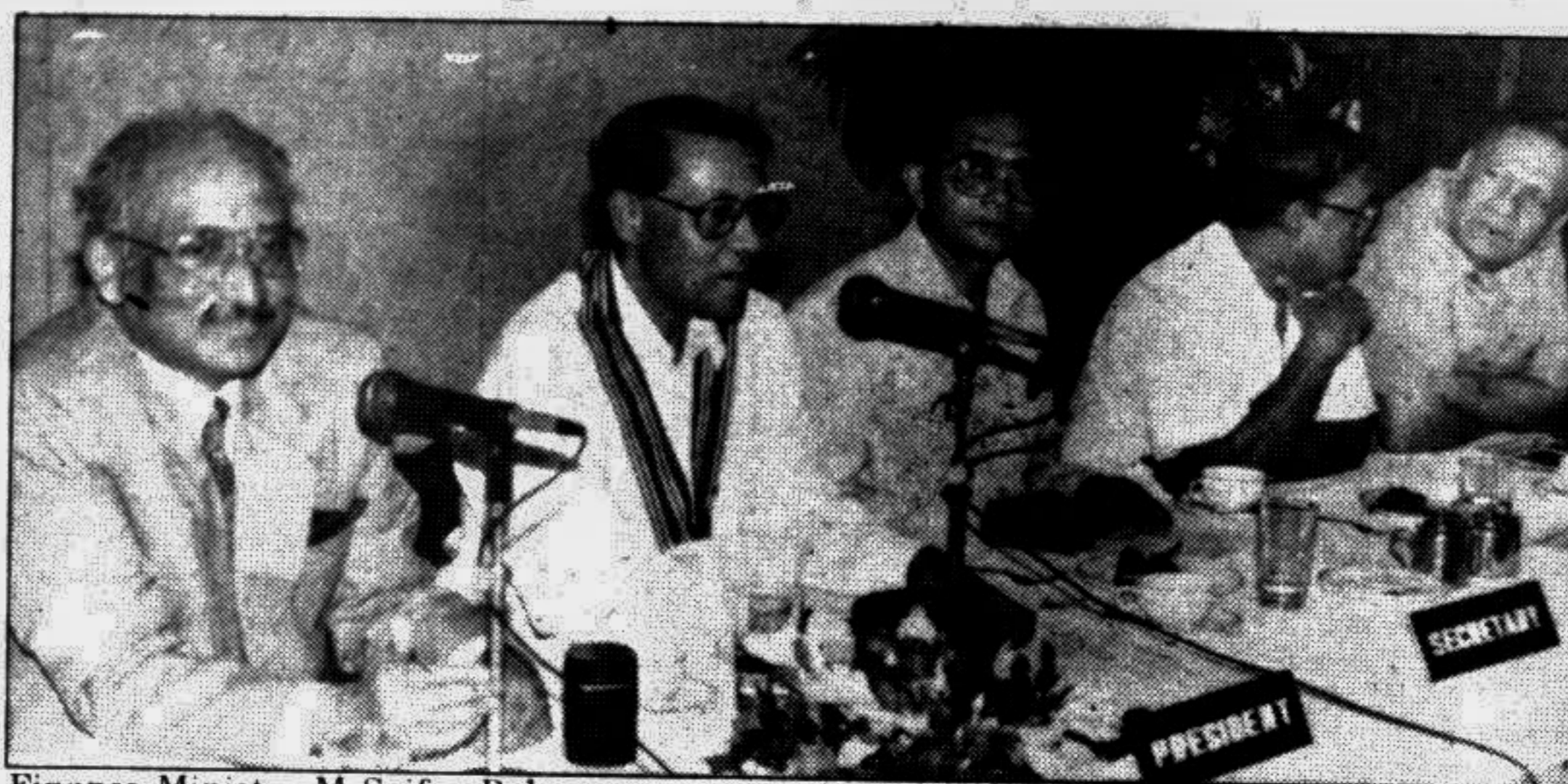
Finance Minister M Saifur Rahman (extreme left) speaking at a function organised by the Rotary Club of Dhanmondi at Sonargaon Hotel in the city yesterday.

They exchanged views on the subjects of mutual interests, particularly on the working of the legal systems of the two countries.