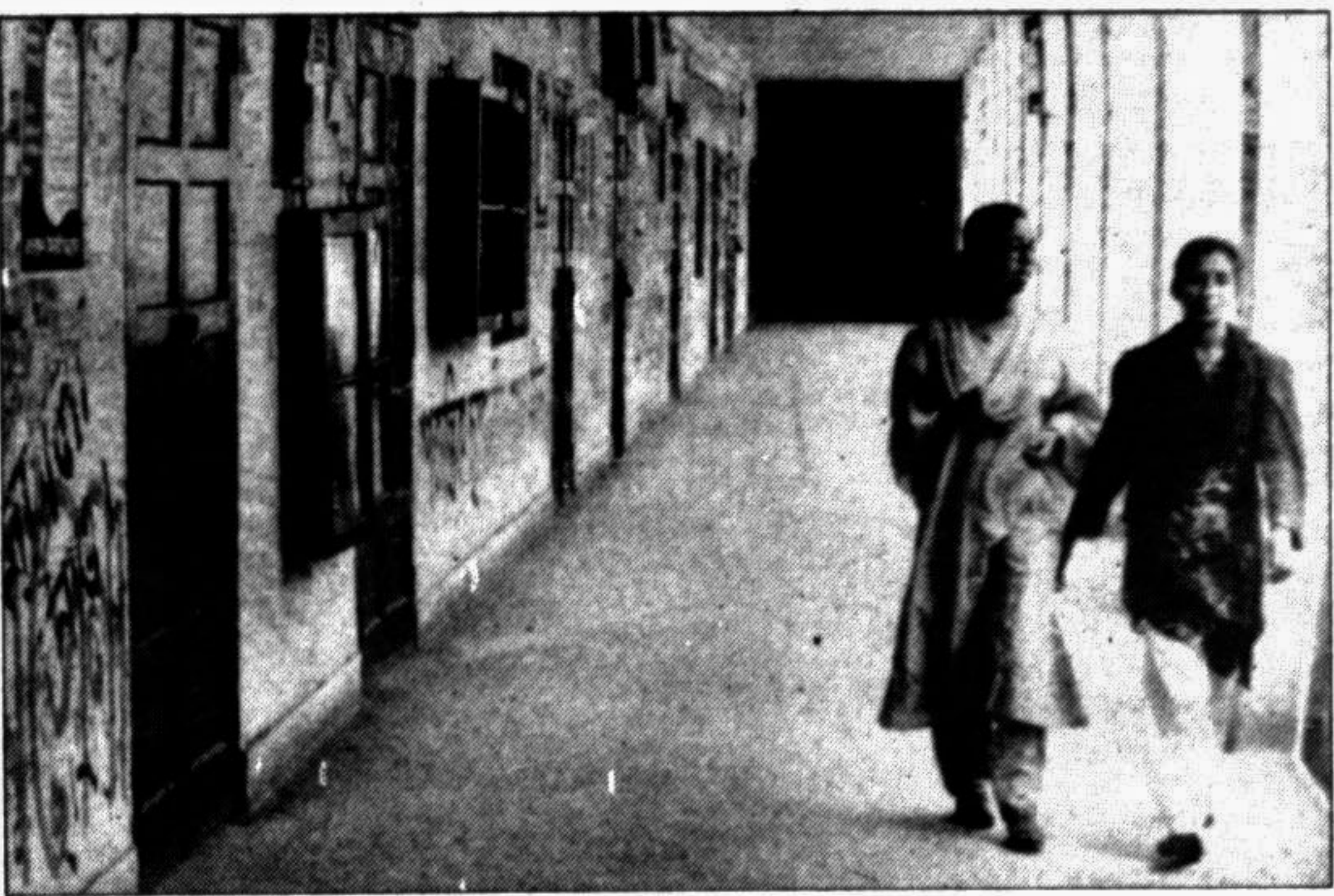
Dhaka University students staged a strike yesterday protesting the alleged rape of a girl student recently at the Zahurul Huq Hall of the university.

BNP Secretary General Abus Salam Talukder yesterday expressed his surprise at the comment of reputed economist British citizen Lord Meghnath Jagadish Chandra Desai that Bangladesh was committing excesses over the Farakka Barrage, reports BSS. In a statement on the comment of Lord Desai that appeared in a section of the press, Talukder said it evokes surprise in the mind of all when the wisdom of a man of the stature of Lord Desai is influenced by sympathy toward ancestral home. It is our firm belief that had Lord Desai made his comment after his visit to the north western districts of Bangladesh, this would have reflected the reality of the situation, he added. In fact the Farakka Barrage is the single biggest factor for causing the greatest harm to the people of this country and also to its climate, weather and ecological balance, he said. Abdus Salam Talukder pointed out that the Farakka Barrage was now a life and death problem for the entire population of Bangladesh. If anybody tried to minimise its problem it would not be acceptable.