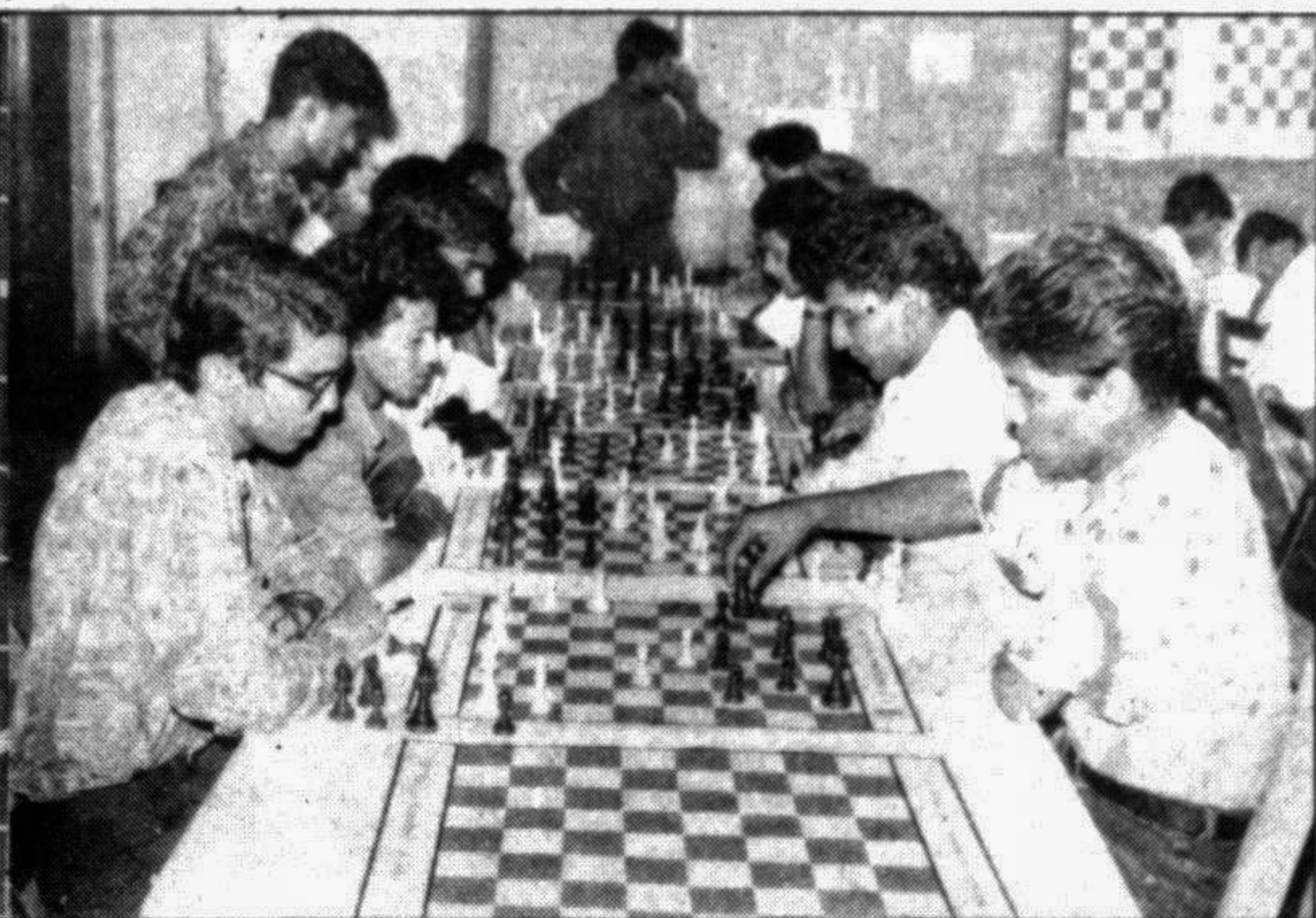
Scene from the fifth round of the qualifying meet for the 20th national championship at the NSC chess room yesterday.