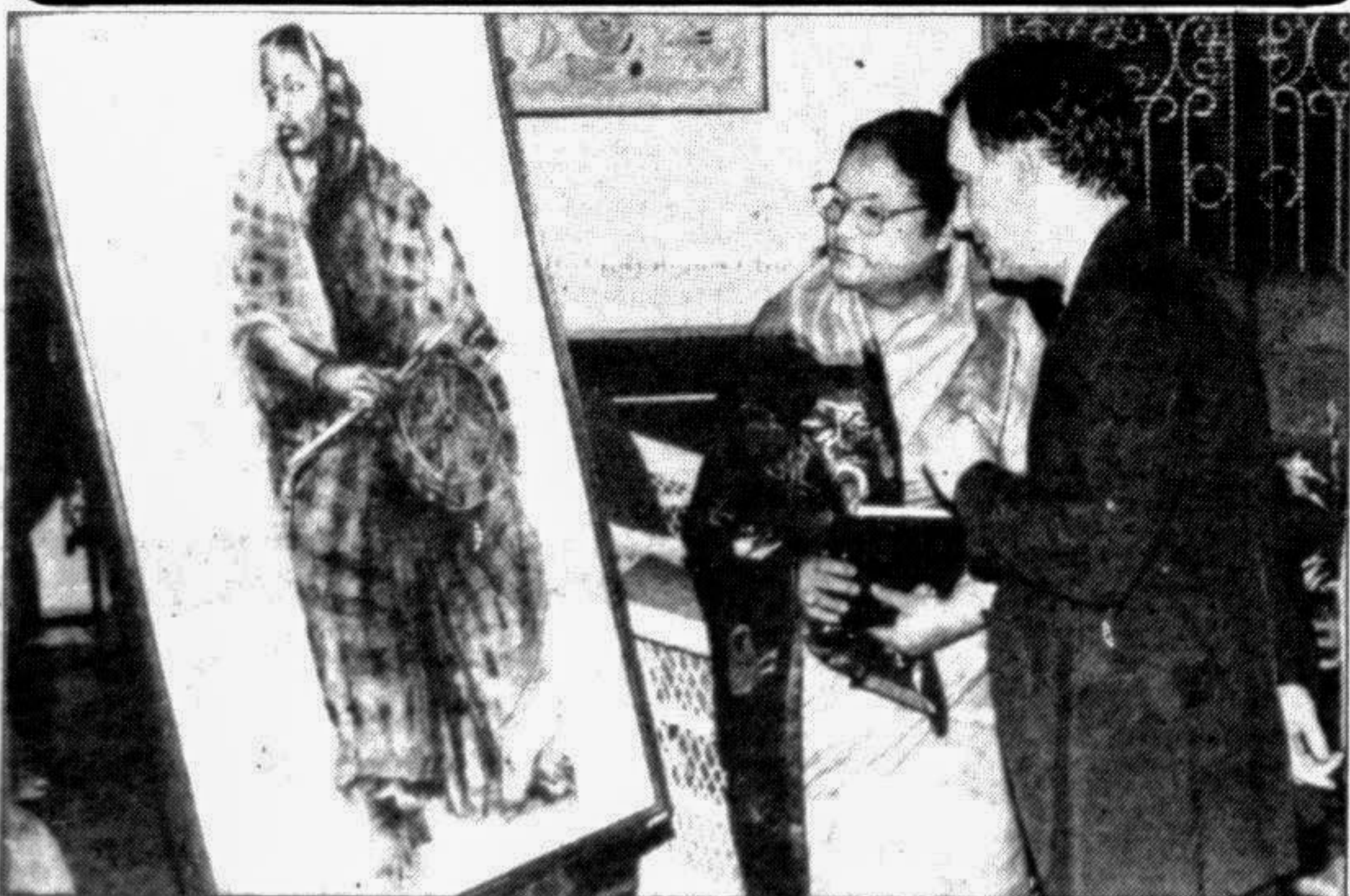
A painting exhibition was held at the residence of French ambassador in the city yesterday. State Minister for Cultural Affairs Prof Jahanara Begum and French Ambassador Jean-Michel Lacombe looking at a work.

Interested journalists have been requested to contact the BCDJC office at 187 Green Road (2nd floor) Dhaka-1205.