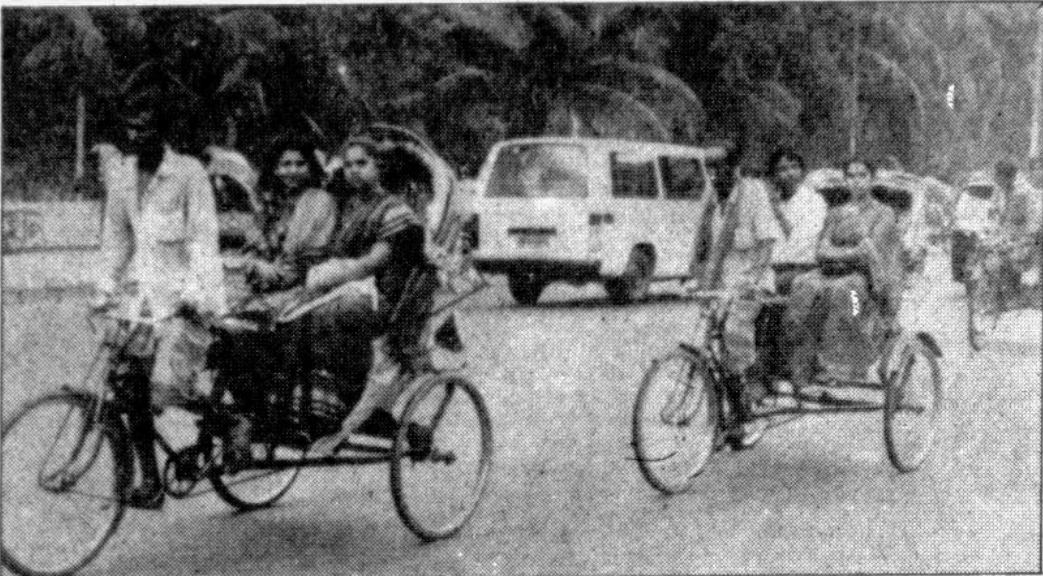
With the day breaking, rickshaws start rolling on the street. Some ride them, others just walk and jog inside the park beside to keep themselves fit.

The keep-fit mania seems to be really overtaking the Dhakaites. You have only to get yourself out of bed anytime before seven am and the truth of this observation will be borne out.