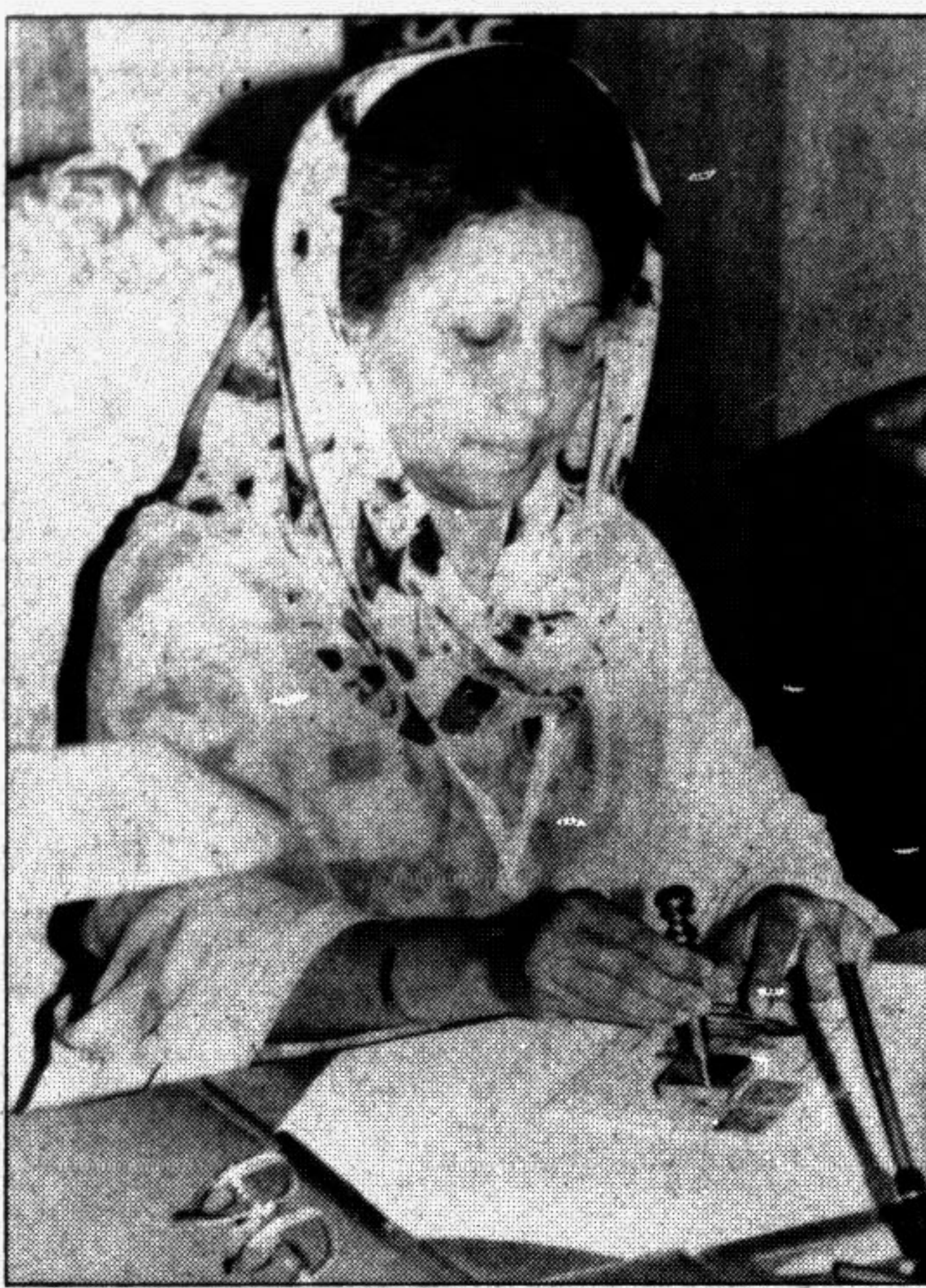
Prime Minister Begum Khaleda Zia released a Commemorative Postage Stamp on the Folk Festivals of Bangladesh issued by Bangladesh Post Office at her Office in the city yesterday.

Perhaps the cuckoo sings a tribute to all that's beautiful and gently reminds us, that all is not lost and let us yet look for the beauty in all things. It does brighten up the day.