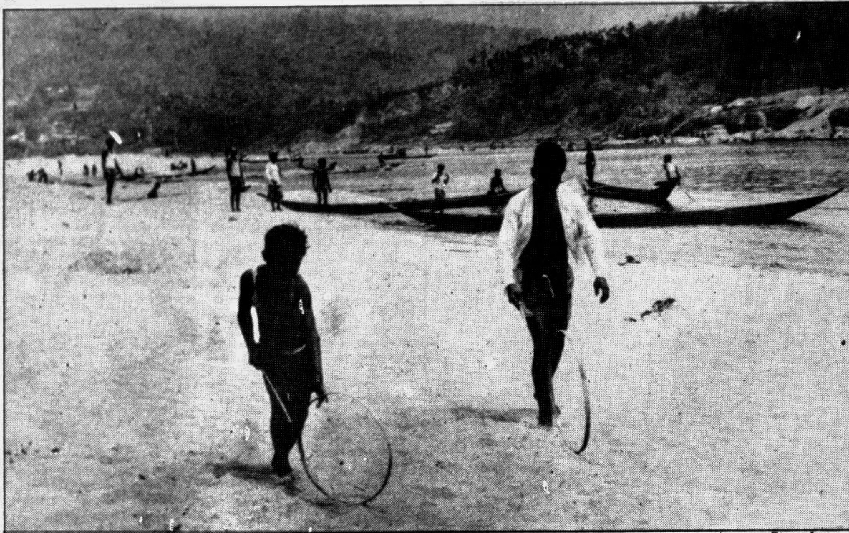
A view of the Tamabeel area of Sylhet district.