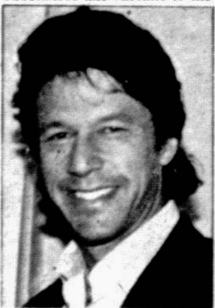
IMRAN KHAN ball, and particularly lifting the seam." Imran is also said to reveal in his biography that he used a bottle top to try and tamper with the ball and make it swing more. "When Sussex were playing Hampshire in 1981 the ball was not deviating at all. I got

"They should ask some ex-cricketers and they will be surprised to discover the types of tampering that have gone on, specially in county cricket in England such as applying substances like vaseline to the