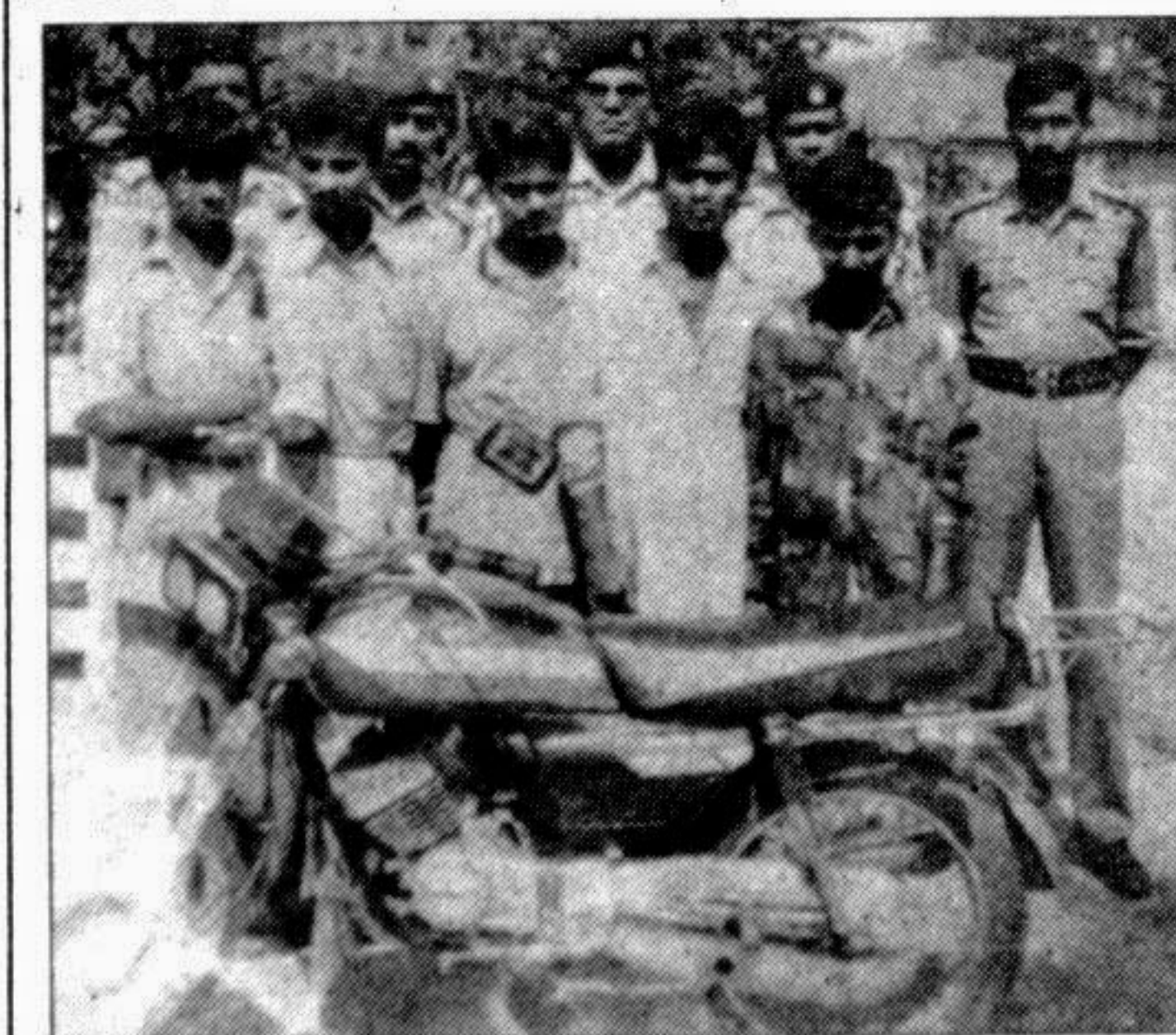
RANGPUR: A stolen motor cycle was recovered and six persons, believed to have stolen the vehicle, were arrested recently. Police believe, an organised gang is engaged in this kind of activities in the town area of the district.

The worst affected areas are Badarganj, Mithapukur, Fulchhari, Shaghatta, Ulipur, Chilmari, Patgram, Kishoreganj and Saidpur thanas in the zone.