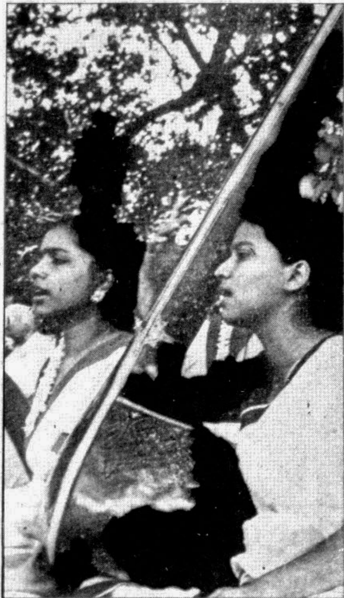
The tradition soiree at Ramna Park welcoming the Bangla New Year.

Obviously, to most people who managed to get near to the Botomul braving an impenetrable thick crowd and oppressive heat that day received the announcement by Chhayanaut with a heavy heart. Without Chhayanaut no celebration of the New Year's Day can be complete. But people with a cultural bend of mind cannot help supporting the stand Chhayanaut has taken. The cultural organisation has not only been