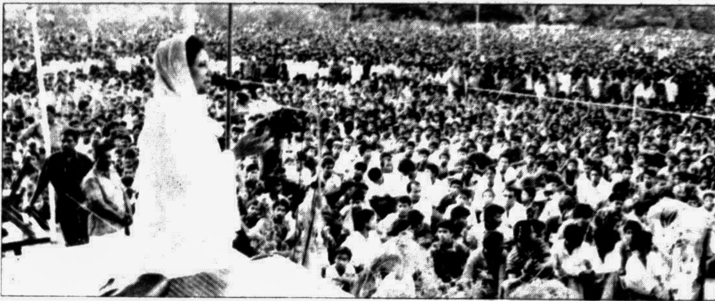
Prime Minister Begum Khaleda Zia addressing a public meeting at Kotchandpur in Jhenidah yesterday.