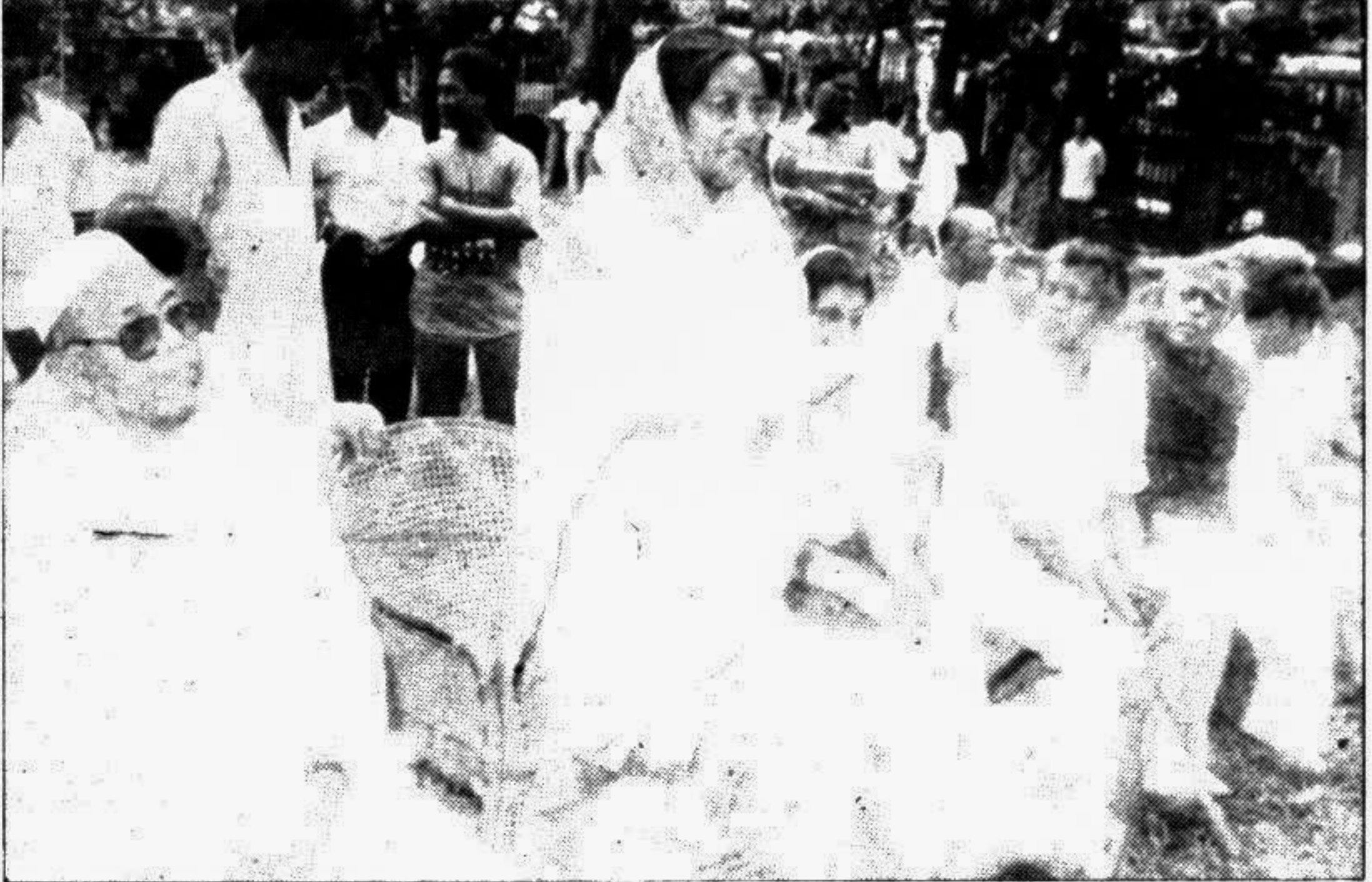
Awami League chief Sheikh Hasina addressing a group of people from Sunamganj who joined her party at her Minto Road residence yesterday.

From Page 1 Col 4 ture and tighten our belts," he said. The finance minister said the government now wants economic growth with reasonable distribution of resources. "We are going for a growth strategy that would ensure employment," he maintained. "I believe that poverty will go down with growth taking place." "Resource will not be a problem, but we need a good guidance for poverty alleviation," he added. He explained that the reform programme which would stop wastage of resources in unproductive sectors and shift them to productive ones will ultimately lead to growth, thus reducing poverty. He said until the private sector comes forward with investment, the government will continue investment in physical and social infrastructure. Saifur Rahman said he is still at a loss about what to do with the surplus employees of some organisations like the TCB, and the import control offices in Dhaka and Chittagong. "The TCB has 1300 workers and the import offices have 600 employees doing virtually nothing," he said, adding "This is a touchy problem." The dialogue revolved round the speech delivered by Prof. Rehman Sobhan. Prof. Sobhan felt that the government should monitor the results of the budget policies, and added, "It is imperative for the finance minister to actively know what is going on because of his policies. This would help correction in the next budget," he said. Being highly critical of the donors, specially the World Bank which, he said, is "the