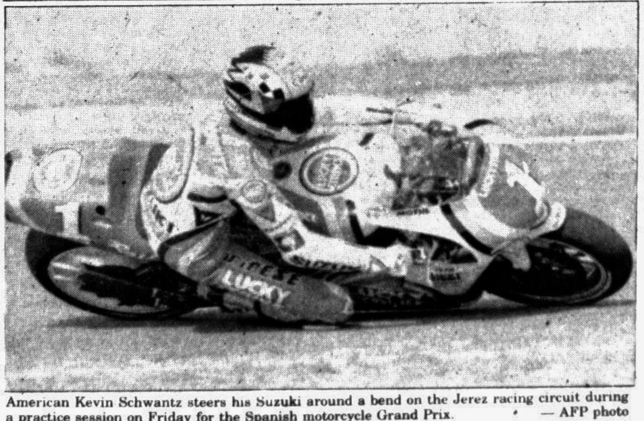
American Kevin Schwantz steers his Suzuki around a bend on the Jerez racing circuit during a practice session on Friday for the Spanish motorcycle Grand Prix.

turned to the scene of his triumph 40 years on Thursday, reports AFP. And, joined by a pilgrimage of master milers at the Ilfley Road track here, he predicted the three minutes 40 second barrier would be broken in his lifetime. Sir Roger was joined by Australian John Landy and Herb Elliott, and from New Zealand Peter Snell and John Walker. There was American Jim Ryun, Tanzania's Filbert Bayi, Frenchman Michel Jazy, Sweden's Arne Andersson, Britain's Derek Ibbotson and Steve Cram and the present world record holder, Algerian Noureddine Morceli.