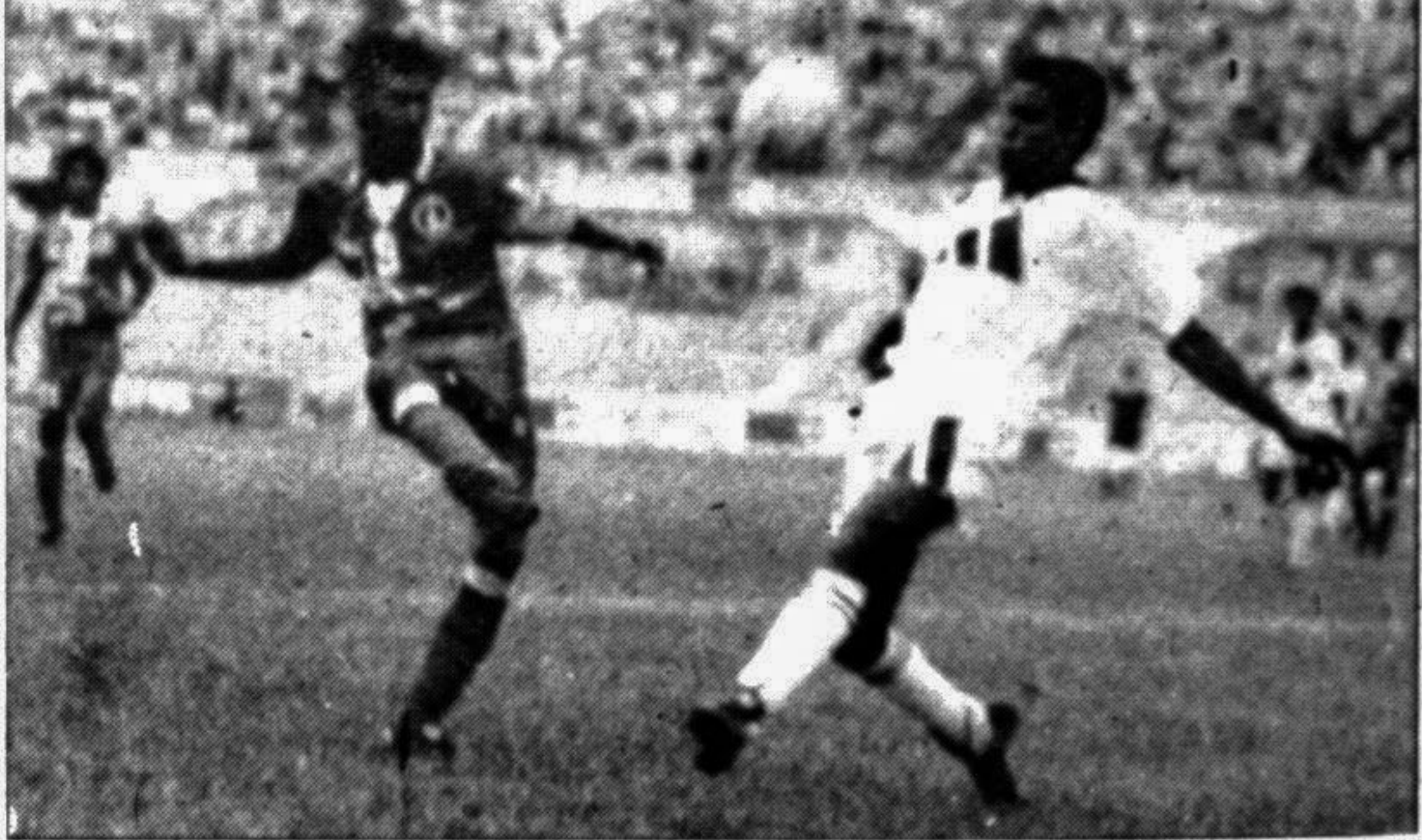
Action from yesterday's DMFA Cup football match between Muktijoddha Kri Chakra Sangsad and Arambagh KS at the Dhaka Stadium. Muktijoddha won 2-0.