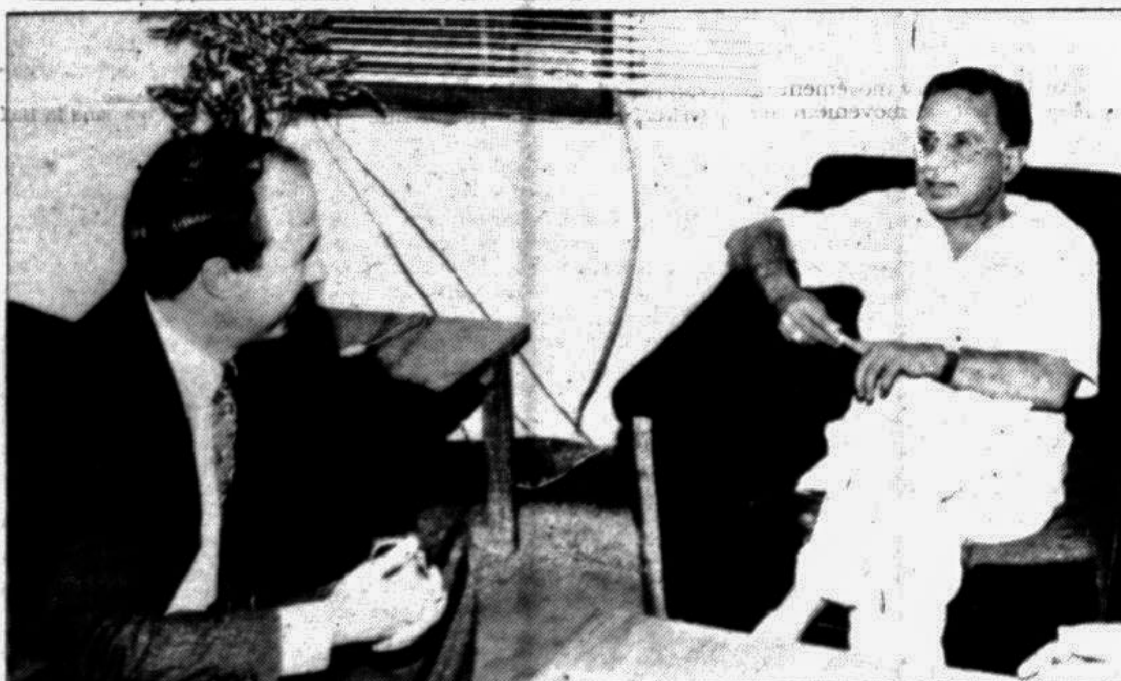
The Visiting Director of the Asia and Oceania Bureau of the United Nations High Commissioner for Refugees Werner Blatter (left) called on the State Minister for Disaster Management and Relief Harun-al-Rashid (R) at the latter's office in the city yesterday.

"SOON OUR NEW PACKAGE BROCHURE FOR 1994-95 WILL BE OUT PLEASE ENLIST YOUR NAME WITH US FOR HAVING A FREE COPY"