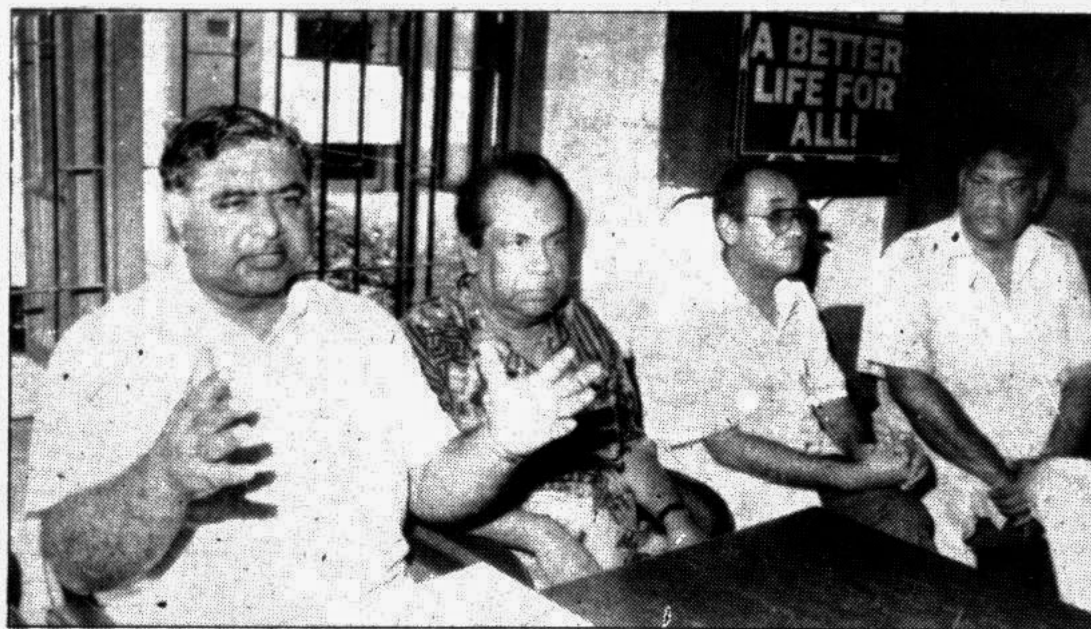
Gono Forum leader Dr. Kamal Hossain talking to the press at the party's central office in the city's Segun Bagicha area yesterday.