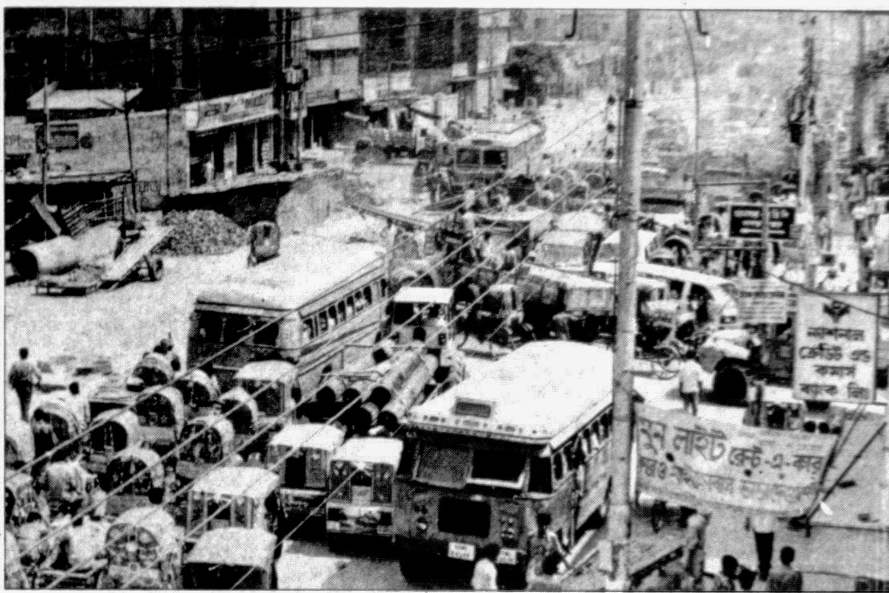
Traffic jams like this have been a regular feature on the city's Rampura Road because of digging up of a portion of the road by the Wasa.