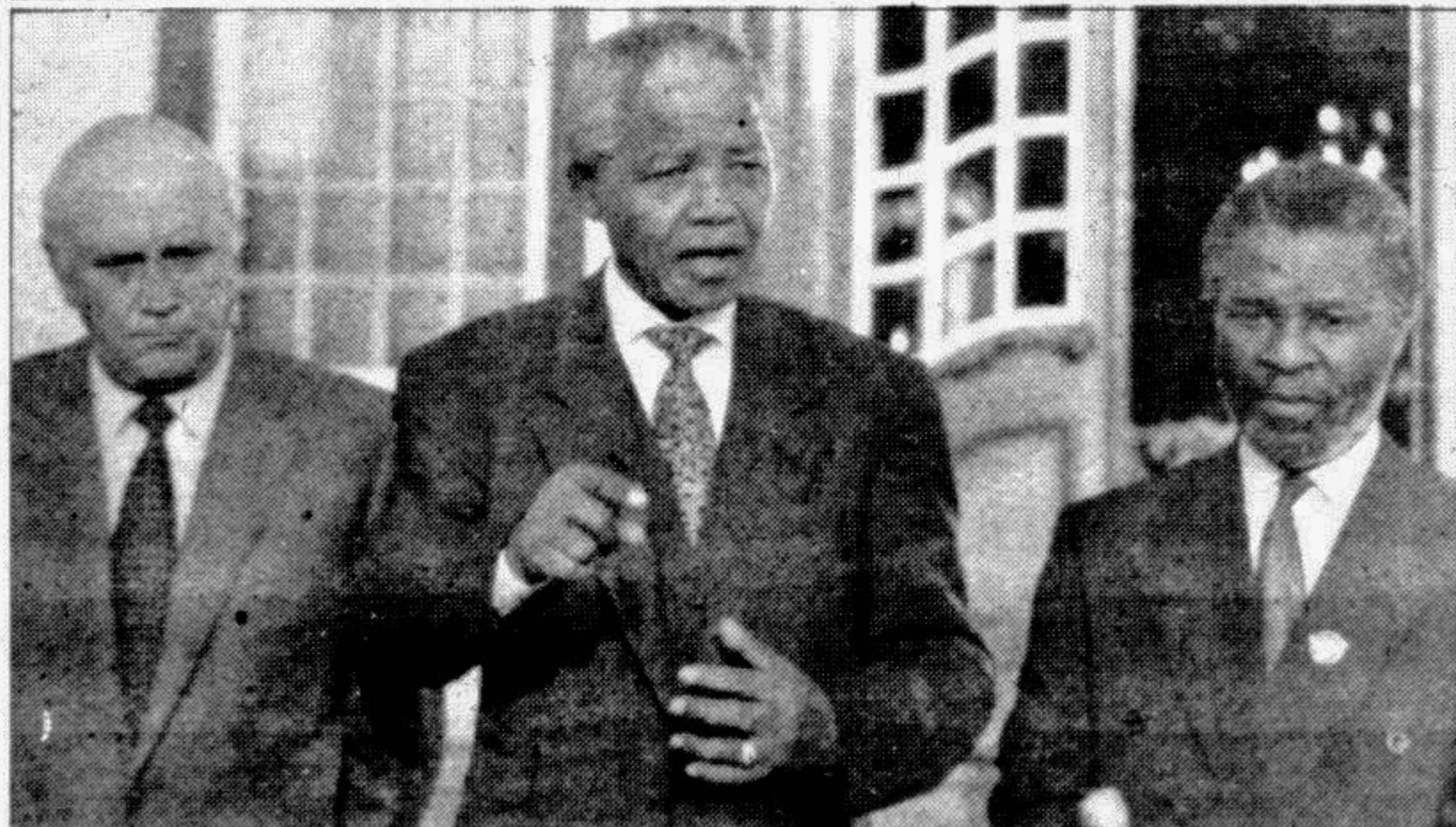
South African leader Nelson Mandela (C) addressing newsmen in Cape Town Friday. Flanking him are Thabo Mbeki (R) of the ANC and the outgoing President F.W. de Klerk, both of whom have been nominated as deputies to Mandela in the new government to be installed today.

Awami League President and Leader of the Opposition Sheikh Hasina leaves Dhaka today for Tokyo to attend a seminar on Democracy and Socio-Economic Development in Asia and the Pacific Region.