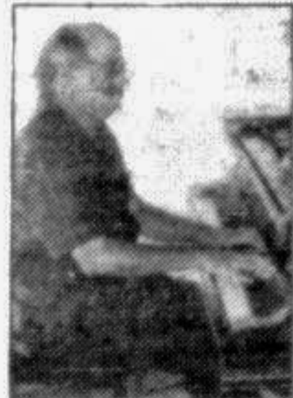
A Man With Big Horizons