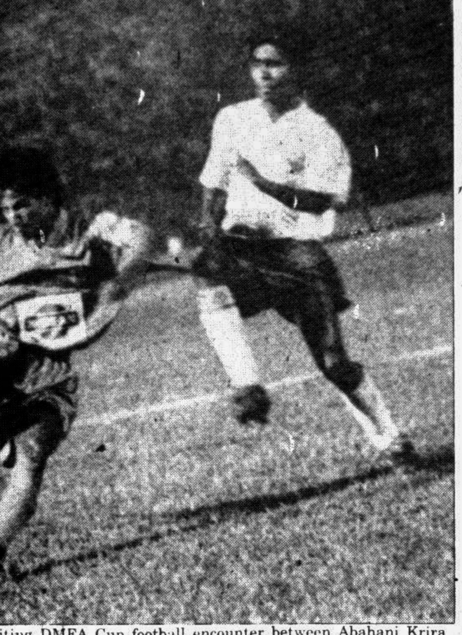
Action from yesterday's exciting DMFA Cup football encounter between Abahani Kira Chakra and Victoria SC at the Dhaka Stadium. Abahani won 3-1.

Tyson is serving a six-year sentence at the Indiana Youth Center in Plainfield. He was convicted in February 1992 of raping beauty pageant contestant Desiree Washington.