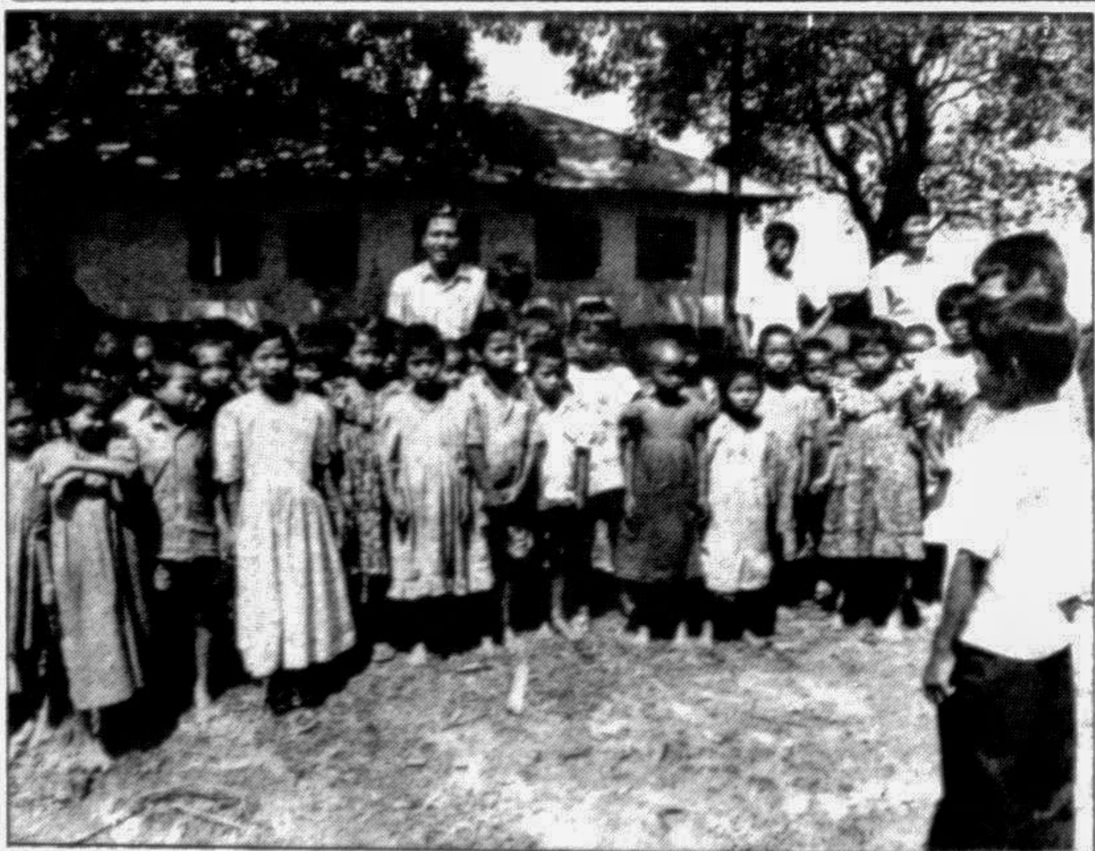
These children of Chakma tribal returnees have now started attending school in the Tarabunia area of the Chittagong Hill Tracts.