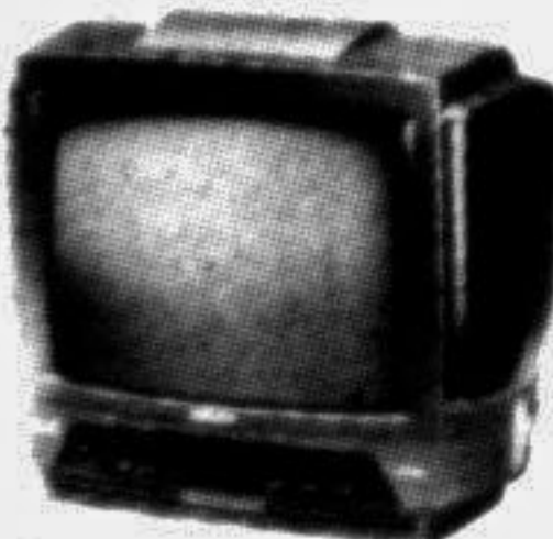
14" CTV with Remote Control

POWER SOUND -Dynamic Bass Boost -2 Speaker -"PowerHorn" (21")