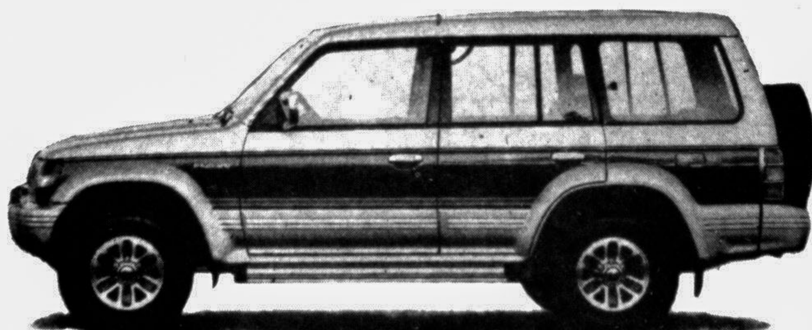
MITSUBISHI PAJERO V6

75 years later, our cars think a lot about you.