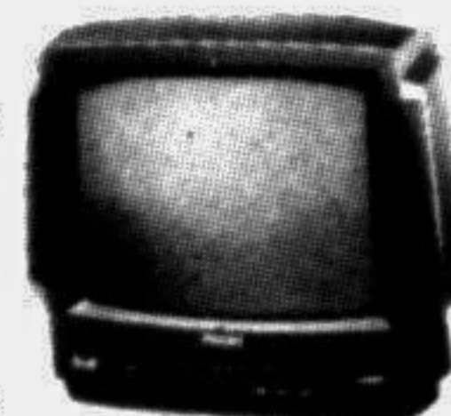
20" CTV with Remote Control

POWER FEATURES -AV Connection -Auto Search & Store -4 Systems (PAL B/G, D, PAL 60, NTSC 3.58, NTSC 4.43)