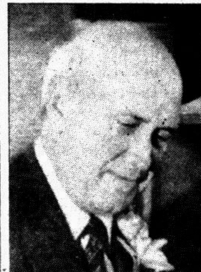
F W de Klerk