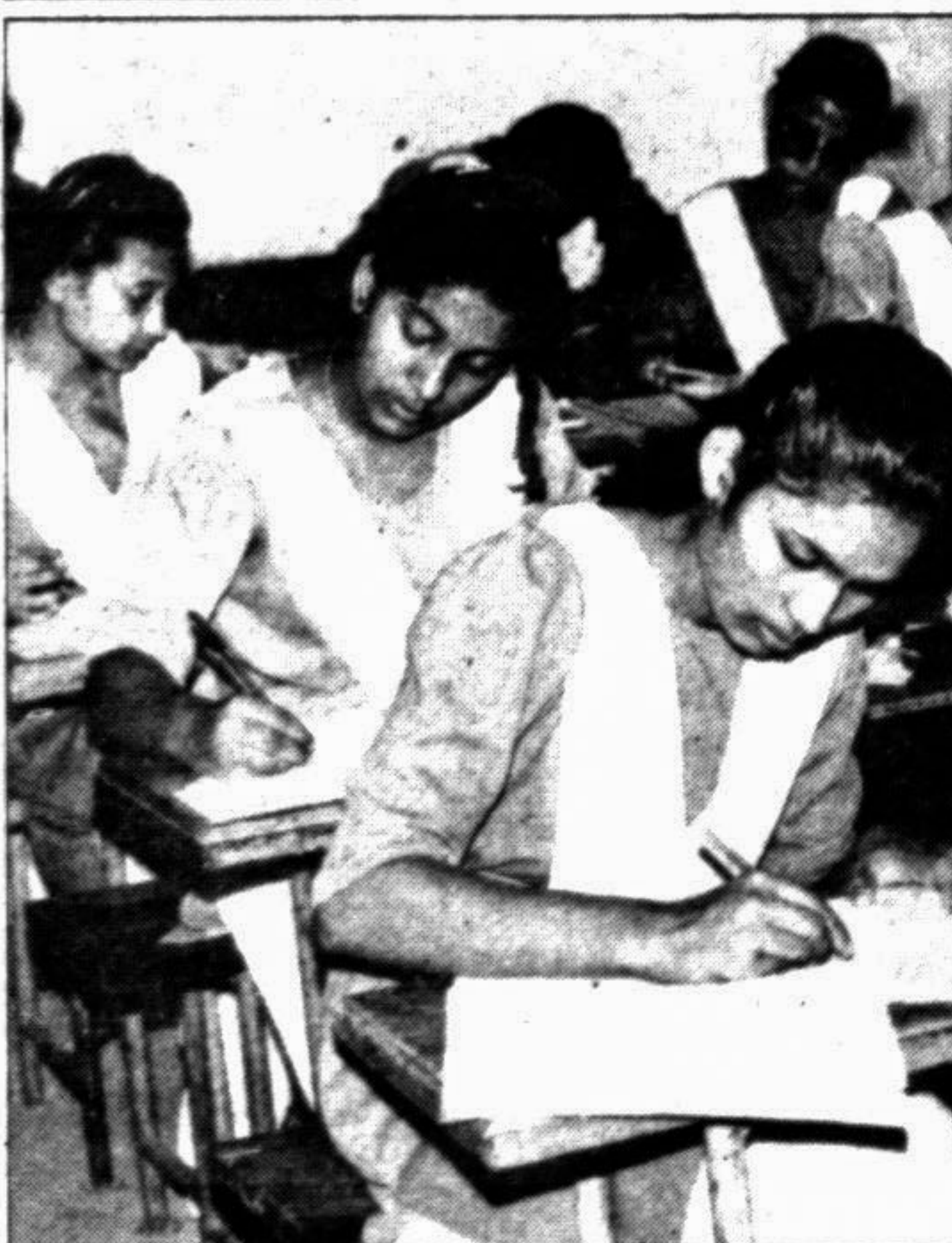
Students appearing at the SSC examination at a city centre on the first day yesterday.