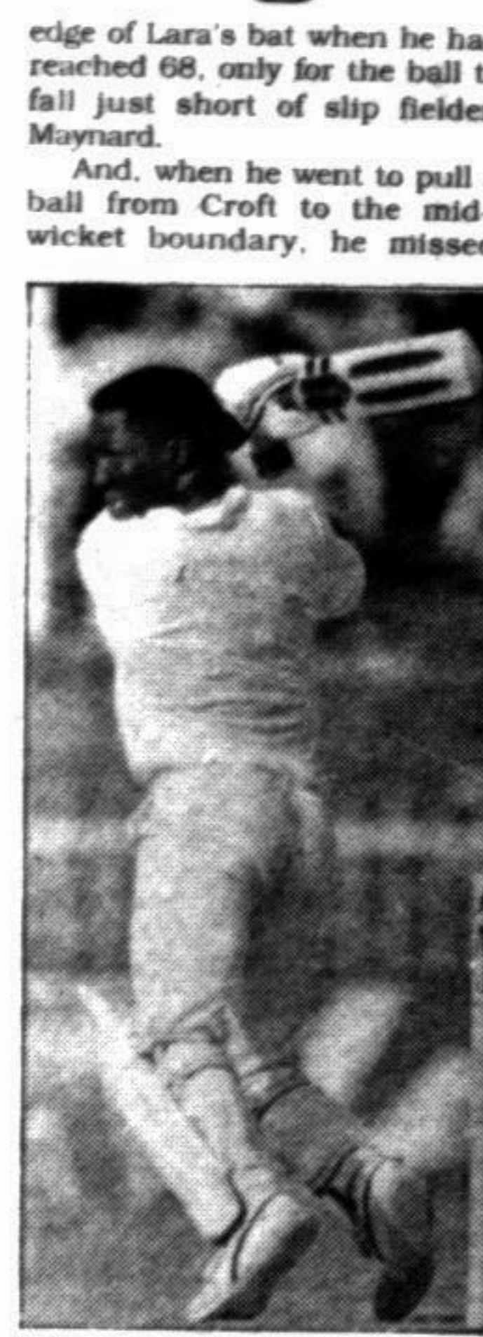
BRIAN LARA ... 147 edge of Lara's bat when he had reached 68, only for the ball to fall just short of slip fielder Maynard. And, when he went to pull a ball from Croft to the mid-wicket boundary, he missed

BIRMINGHAM, England, Apr 30: West Indian batting star Brian Lara followed up his world record Test score of 375 by hitting a masterful century Friday on his debut for Warwickshire in English county cricket, reports AP. The left-handed Trinidadian, whose last innings was the world record score against England, appeared to carry on at Edgbaston as he had left off at St John's, Antigua, 11 days ago. Lara, 24, hit five different Glamorgan bowlers for a six and 16 fours as he reached his century in only 104 minutes. He raised his bat and helmet aloft after powering a ball from seam bowler Roland Leafevre through extra cover for four. He struck another six off spin bowler Robert Croft and seven more fours before he was out for 147. Going for a drive through the offside field, he thin-edged a catch to slip fielder Matthew Maynard off Croft's bowling. Lara needed eight balls to score his first runs as a Warwickshire player, punching the ball through the offside field for a four. He went on to produce his full range of shots, including a pull off his hips similar to the one in Antigua that took him past Sir Garfield Sobers' 36-year-old record of 365. That one went for four, this one went for six. Three times Lara was close to getting out although he looked totally in control during his 165-minute innings. Otis Gibson, a Barbadian taken on by Glamorgan this season, beat him outside the off stump with a rising delivery when he had scored 20. Leafevre found the outside