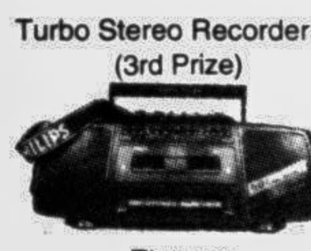
Turbo Stereo Recorder (3rd Prize)