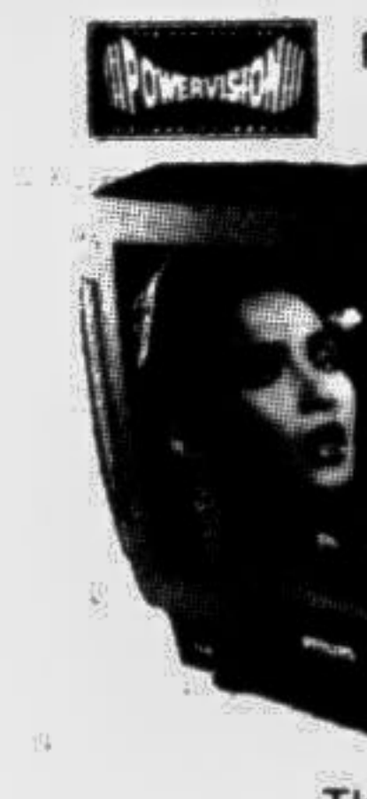
Powervision CTV 21" (1st Prize)