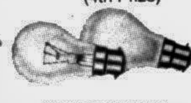
4 Dozens of Philips Bulbs (4th Prize)