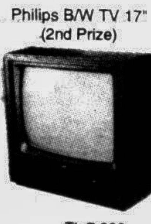
Philips B/W TV 17" (2nd Prize)