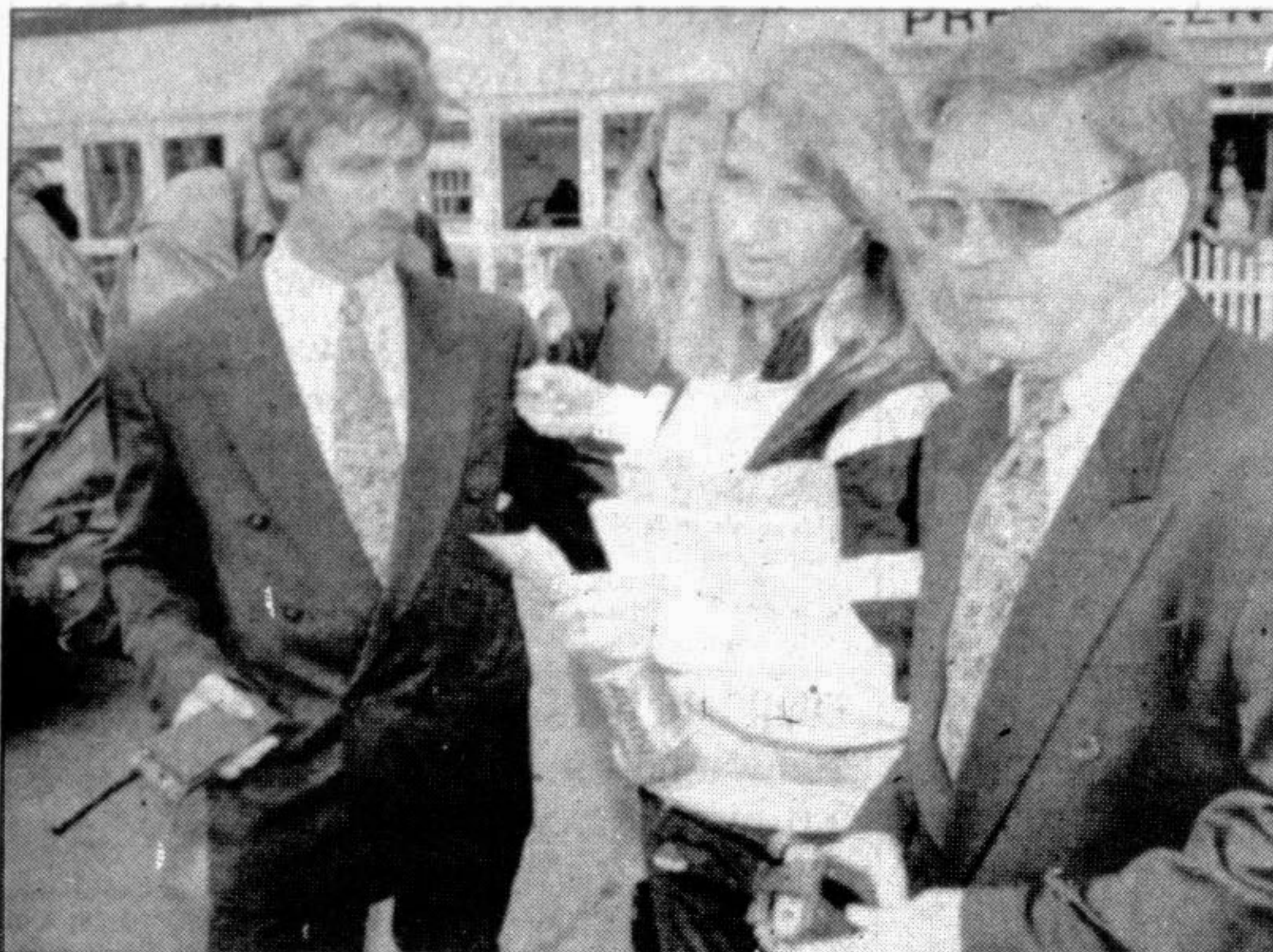
German tennis star Steffi Graf (C) is escorted by her bodyguards as she leaves Hamburg's Rothenbaum tennis courts following her press conference yesterday.