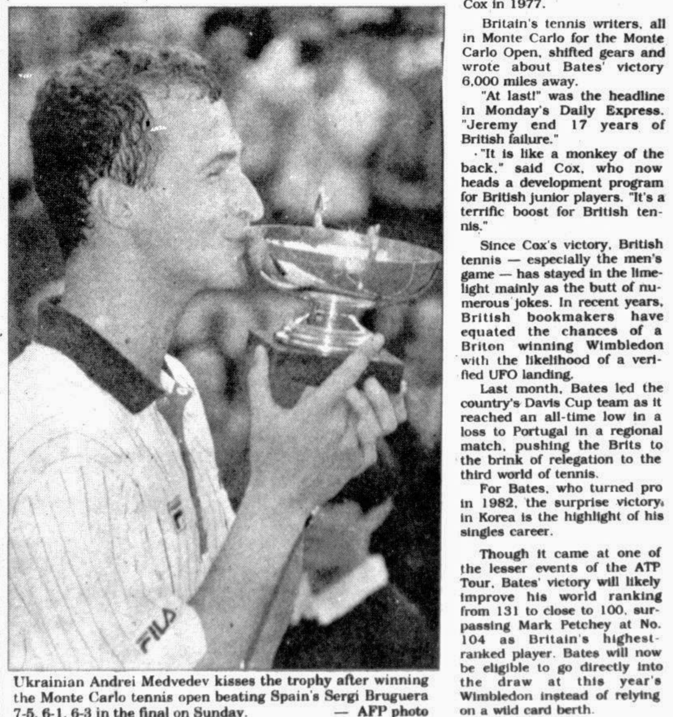
Ukrainian Andrei Medvedev kisses the trophy after winning the Monte Carlo tennis open beating Spain's Sergi Bruguera 7-5, 6-1, 6-3 in the final on Sunday.