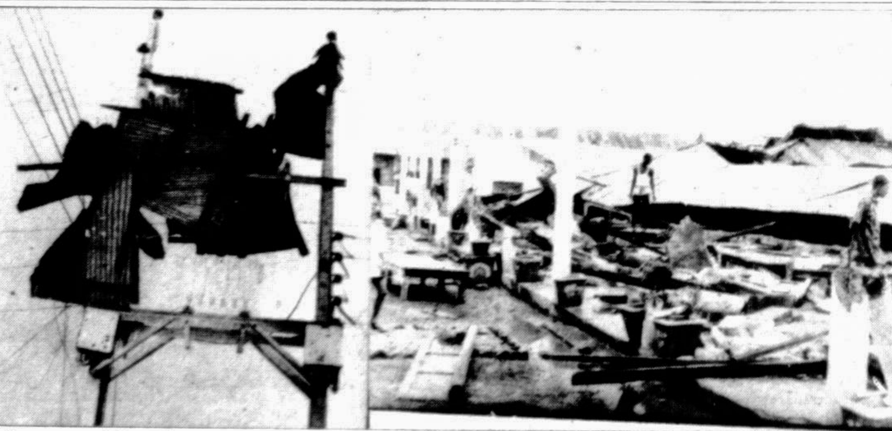
Some areas of Noskhali and Luxmipur districts were hit by nor'wester recently. Pictures show some of the damaged houses and electric lines.

The procession, participated by Tele-Communication Minister Tarique Islam, was marched through main roads of Jessore town, raised slogans against drug addiction, terrorism and extortion. The processionists also carried anti-hartal placards.