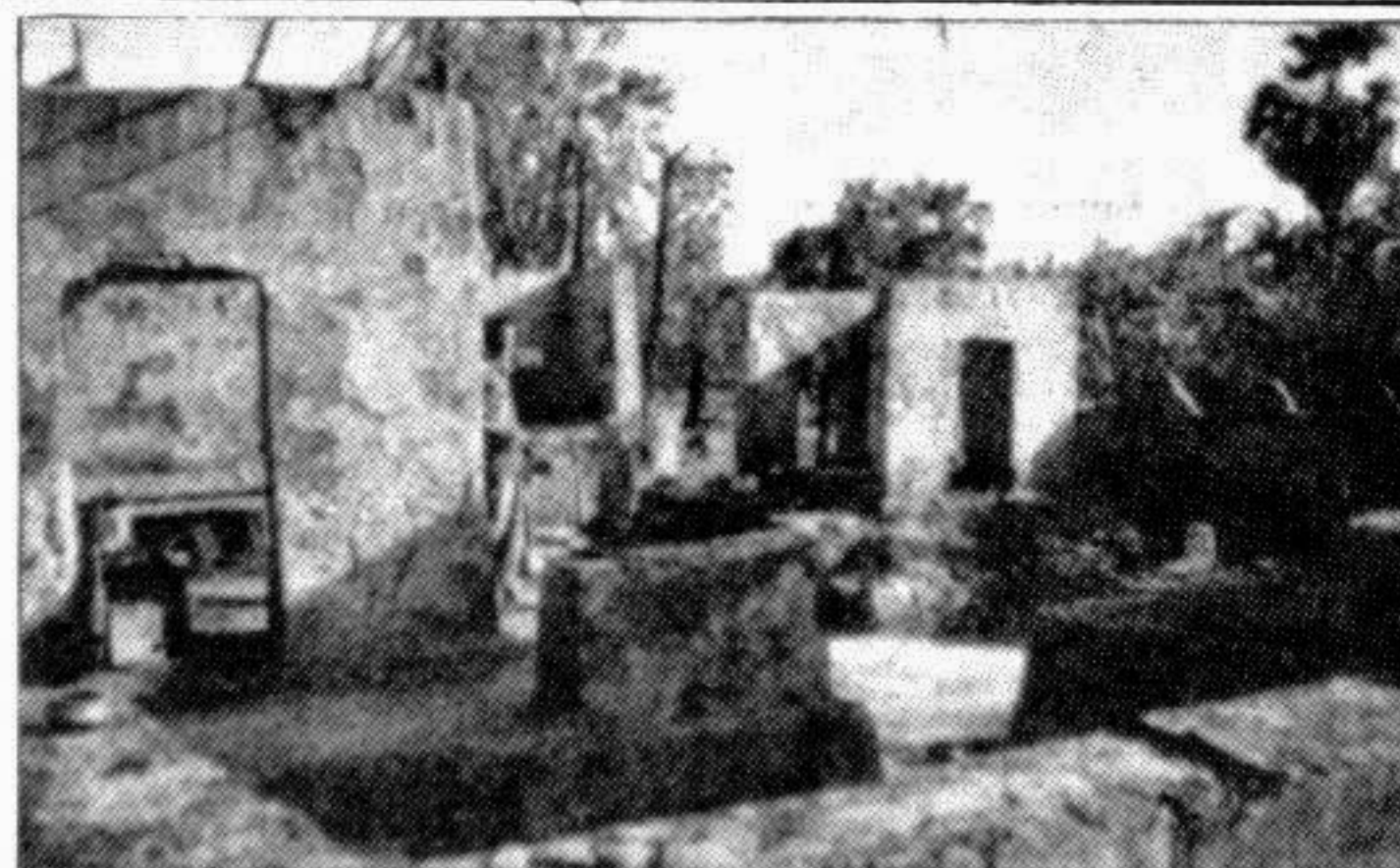
A total of 107 families in two thanas namely Debhata, Kaliganj of Satkhira district were rendered homeless as their houses were burnt to ashes following a devastating fire which broke out here on April 17. Photo shows one of the houses affected by the fire incident.

But no action has yet been taken by the district administration against the dishonest traders in spite of repeated appeals by the suffers.