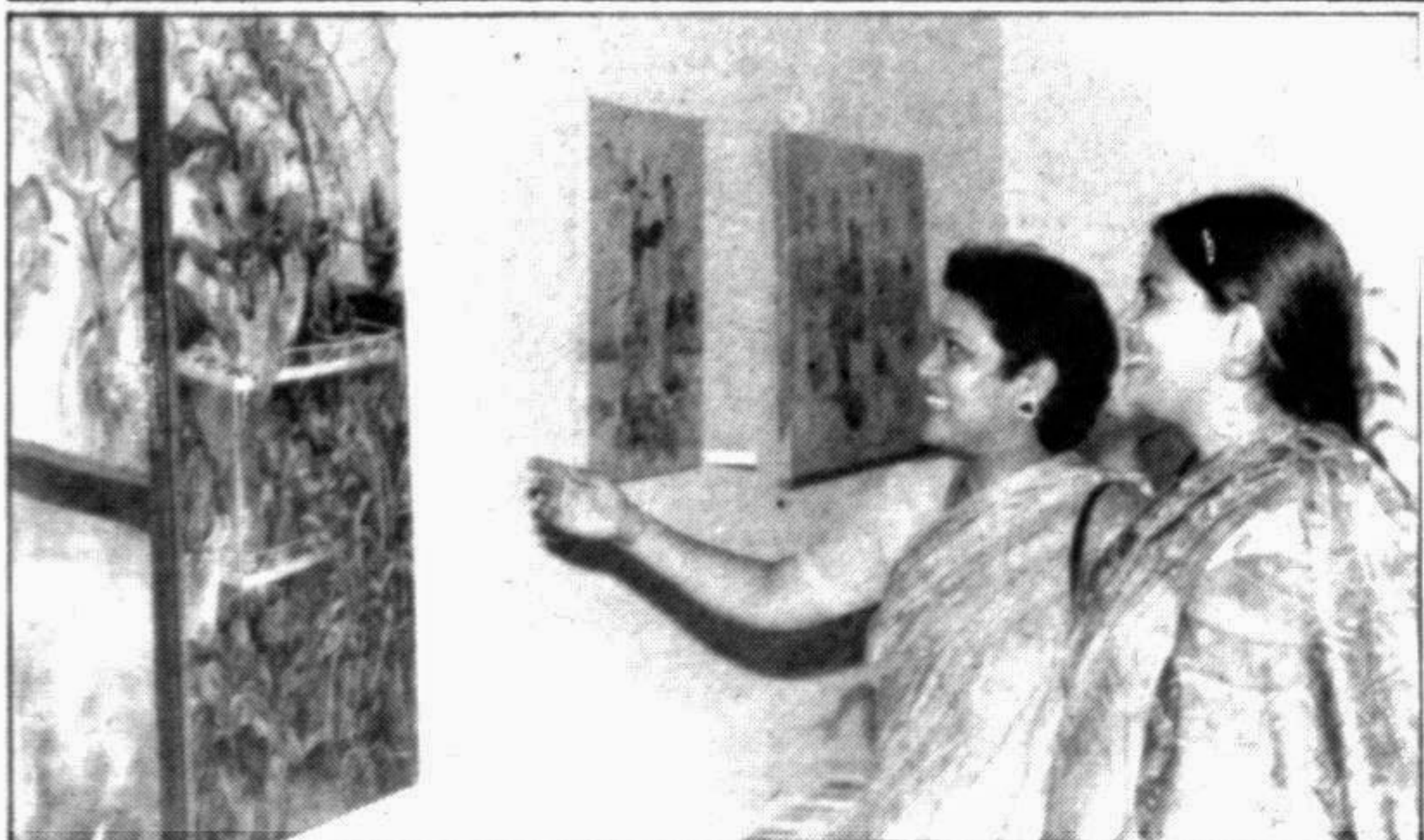
Visitors looking at an art work at Arial Gallery. A 10-day long art exhibition by the Dhaka painters, a group of four artists, began at the gallery yesterday.

BANGLADESH THAI ALUMINIUM LTD. 70, Dilkusha Commercial Area, Dhaka-1000, Bangladesh Phone: 243163, 232077, 243252, Fax No.: 880-2-863424