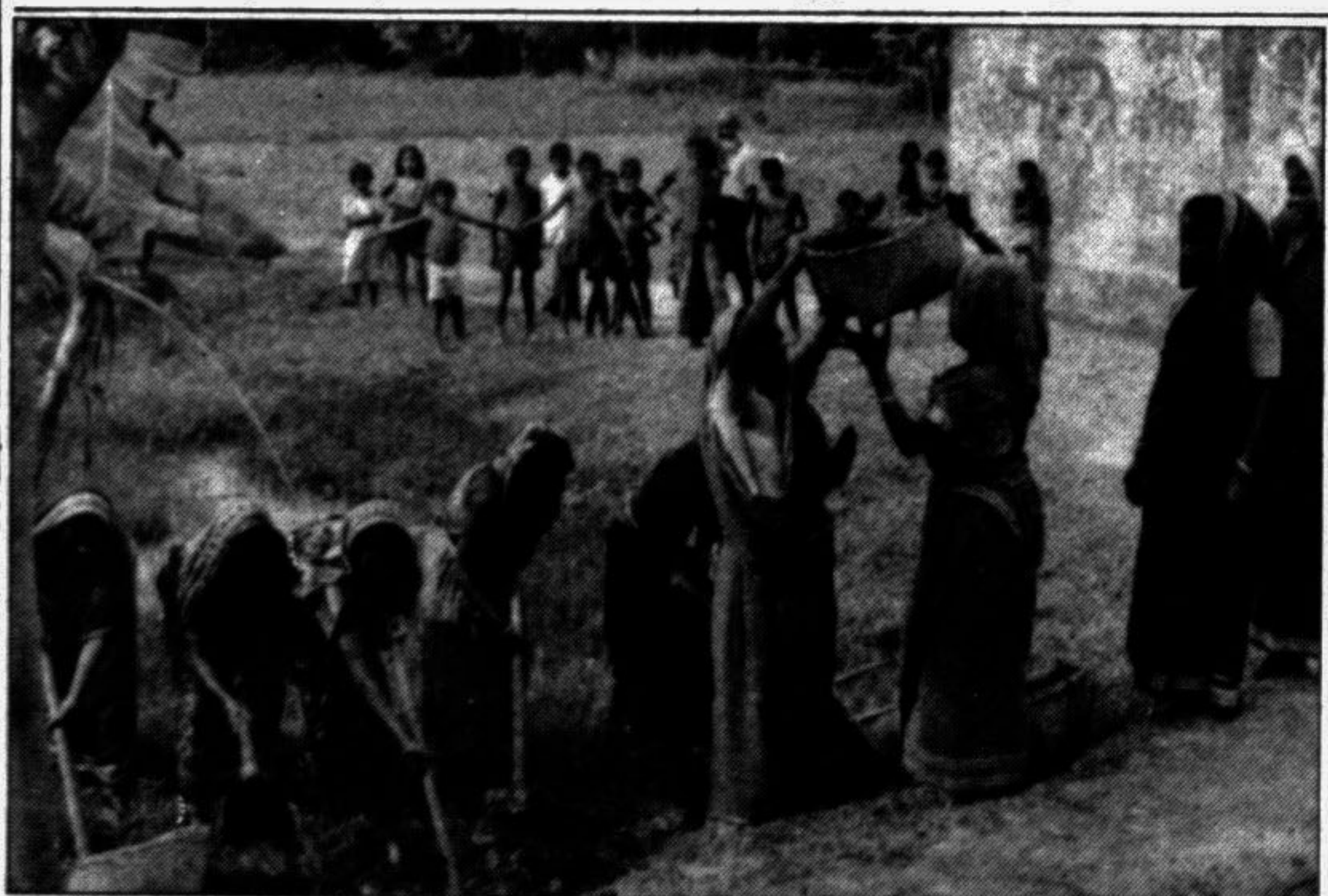
A team of assetless women maintaining a village road in Sherpur district under the Rural Maintenance Programme (RMP) of CARE.

The conservancy service of the pourashava area is not satisfactory. There is no public latrine or urinal in the town areas. Most of the roads in the town are dirty and full of garbages. There is no arrangement for cleaning the roads. Apart from this, there are some places inside the pourashava area which remains full of water-hyacinth for months together.