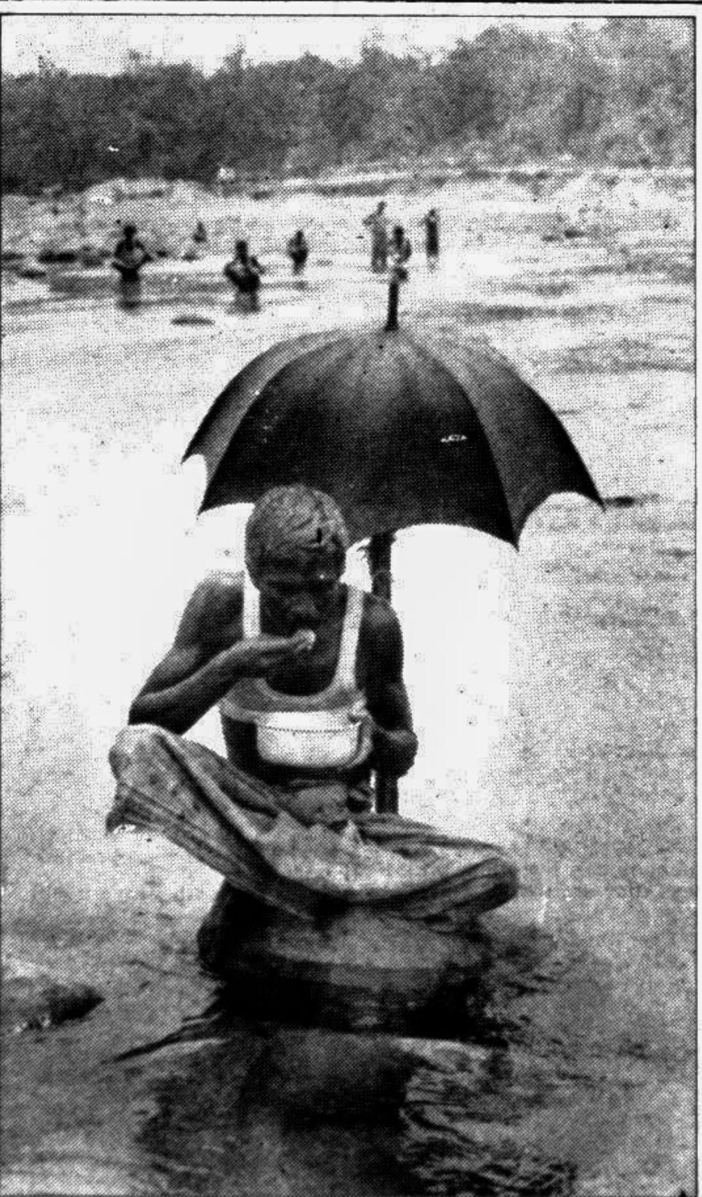
LUNCH TIME: This man, a day labour, earns his bread by breaking stones at Tamabil area under Jafflong thana of Sunamgonj district.