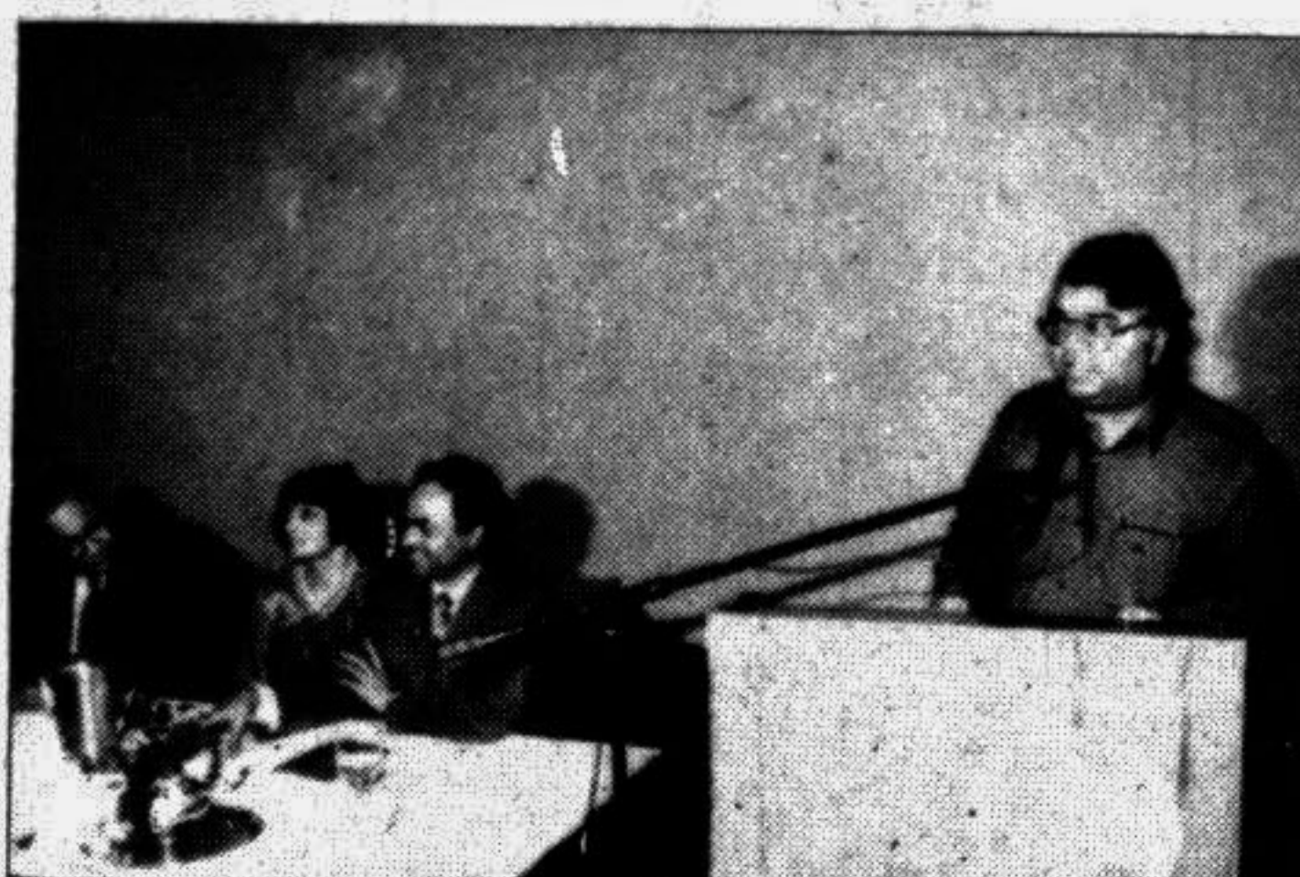
Information Minister Barrister Nazmul Huda speaking at a reception accorded to the visiting British Member of Parliament Keith Vaz at a hotel in Dhaka yesterday.

4:30 Opening announcement Al-Quran Programme summary 4:45 Desh O Bighan 5:10 News in Bangla 5:25 Cartoon show: Tom And Jerry Kids Show 5:40 Sports programme: Cricket 6:30 Population programme: Mayday Janya 7:00 Open University 7:25 Tagore songs 8:00 News in Bangla 8:30 Amar Desh 9:00 Film show: The Sword Of Tipu Sultan 10:00 News in English 10:30 Shurabance 11:30 Khabar/The News