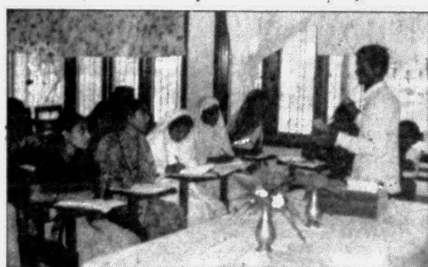
Female members of a number of co-operative societies are being given lessons on account keeping.

All of the credit goes to KTCCA Ltd, which happens to be a central association of two tier mutually dependent co-operative system. The first one is based on village