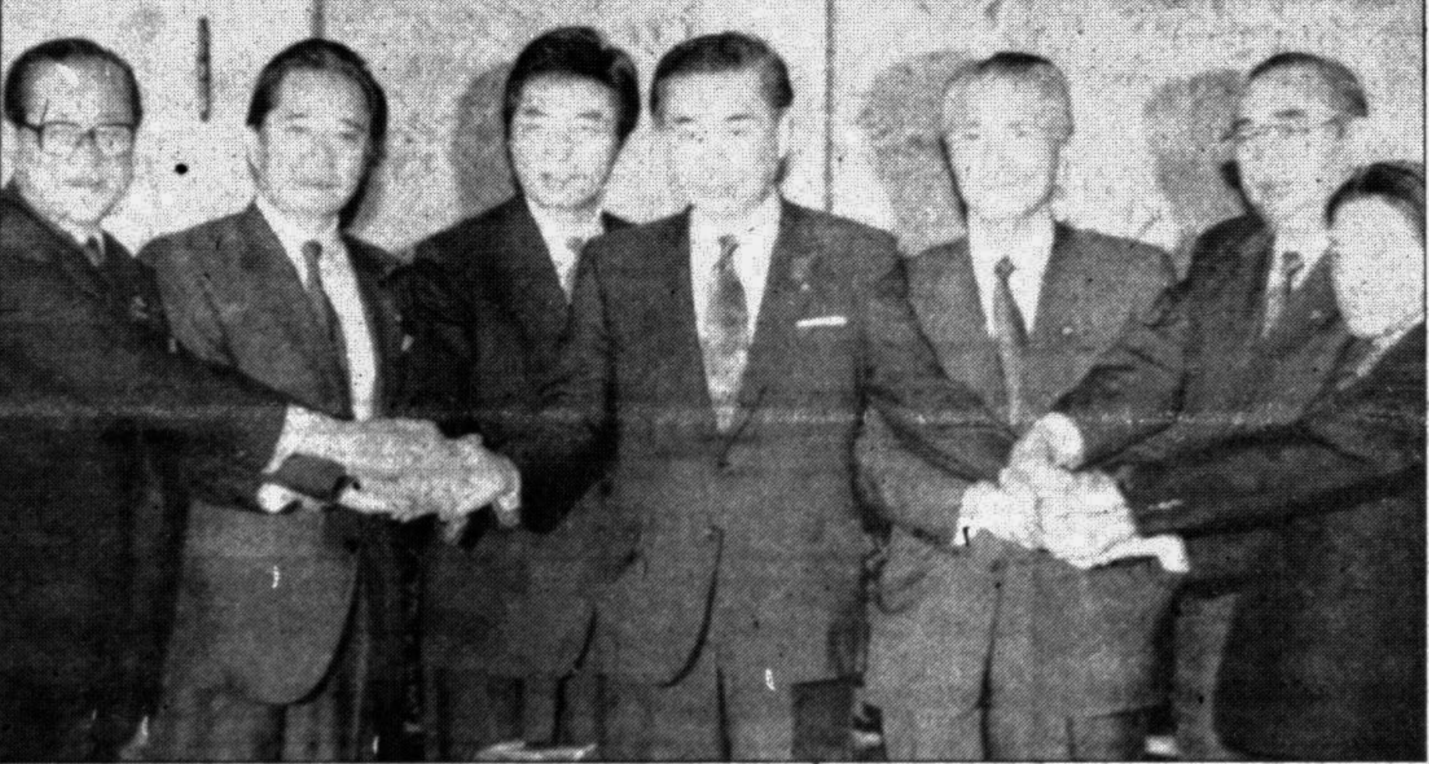
Tsutomu Hata (C), the ruling coalition's nominee for the Japanese premiership, shakes hands with outgoing Prime Minister Morihiro Hosokawa (third from left) and other coalition leaders during a meeting at the Diet building in Tokyo yesterday.