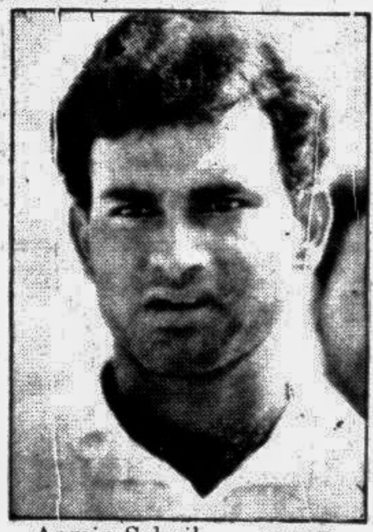
Aamir Sohail..... m-o-m

Sports Reporter Sharjah and Pakistan, it seems, are made for each other. The world champions of one-day cricket yesterday reaffirmed their status as the bosses of instant cricket by retaining the Australasia Cup for a third time at Sharjah with a 39-run win over neighbours India. Powered by strokeful half-centuries from man-of-the-match, as well as man-of-the-series Aamir Sohail and Basit After having seemingly recovered from the early loss of opener Ajay Jadeja to some hostile fast bowling by Wasim Akram, India quickly lost the important wickets of Tendulkar, Sidhu and skipper Azharuddin. The much-touted middle-order batsman, left-handed Atul Bedade, underlined his reputation as a big-hitter with a quartet of sixes but India See Page 12 Col 5 Detailed report on Page 10 Alli, Pakistan totalled 250 for six from their allotted 50 overs. After a rollicking start given by the in-form Sohail and Saeed Anwar, Pakistan suffered a mini collapse as India staged a comeback with off-spinner Rajesh Chauhan snaring three batsmen in quick succession, including captain Salim Malik. But Basit, and later a resourceful Rashid Latif, duly got them in the vicinity of 250 with some scintillating strokeplay. India, who returned to the desert after a three-year lay-off alleging pro-Pakistan bias among the organisers, got off to shaky start in their quest for the victory target of 251 runs.