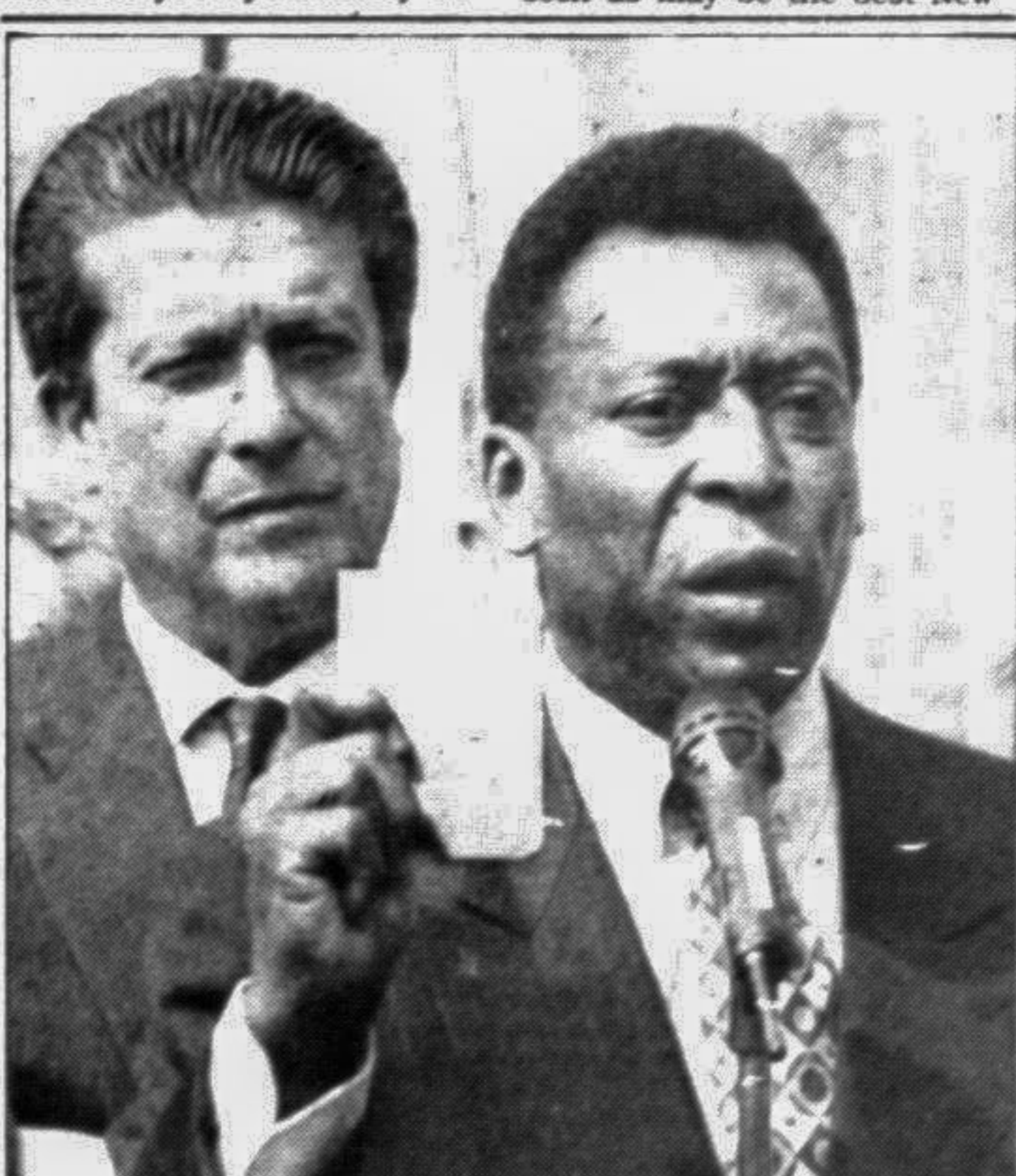
Brazilian soccer legend Pele shows his UNESCO passport, given by the organisation's general secretary Federico Mayor (L) after he was nominated as their goodwill ambassador in Paris on Tuesday.

"When you have been criticised for your personality in