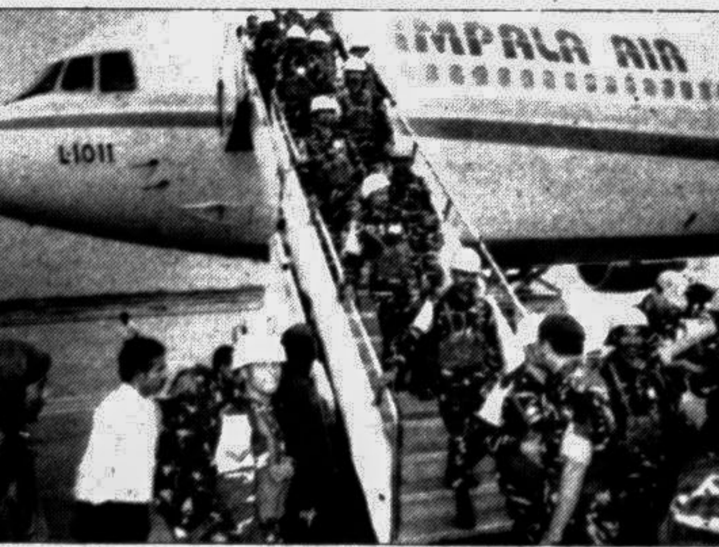
Bangladesh Armed Forces personnel alighting the special UN chartered aircraft which brought them back from Rwanda yesterday.

The shelters, during the normal time, will be used either as schools, clinics or as meeting and function halls depending on the programmes implemented by BNPS and BSUS.