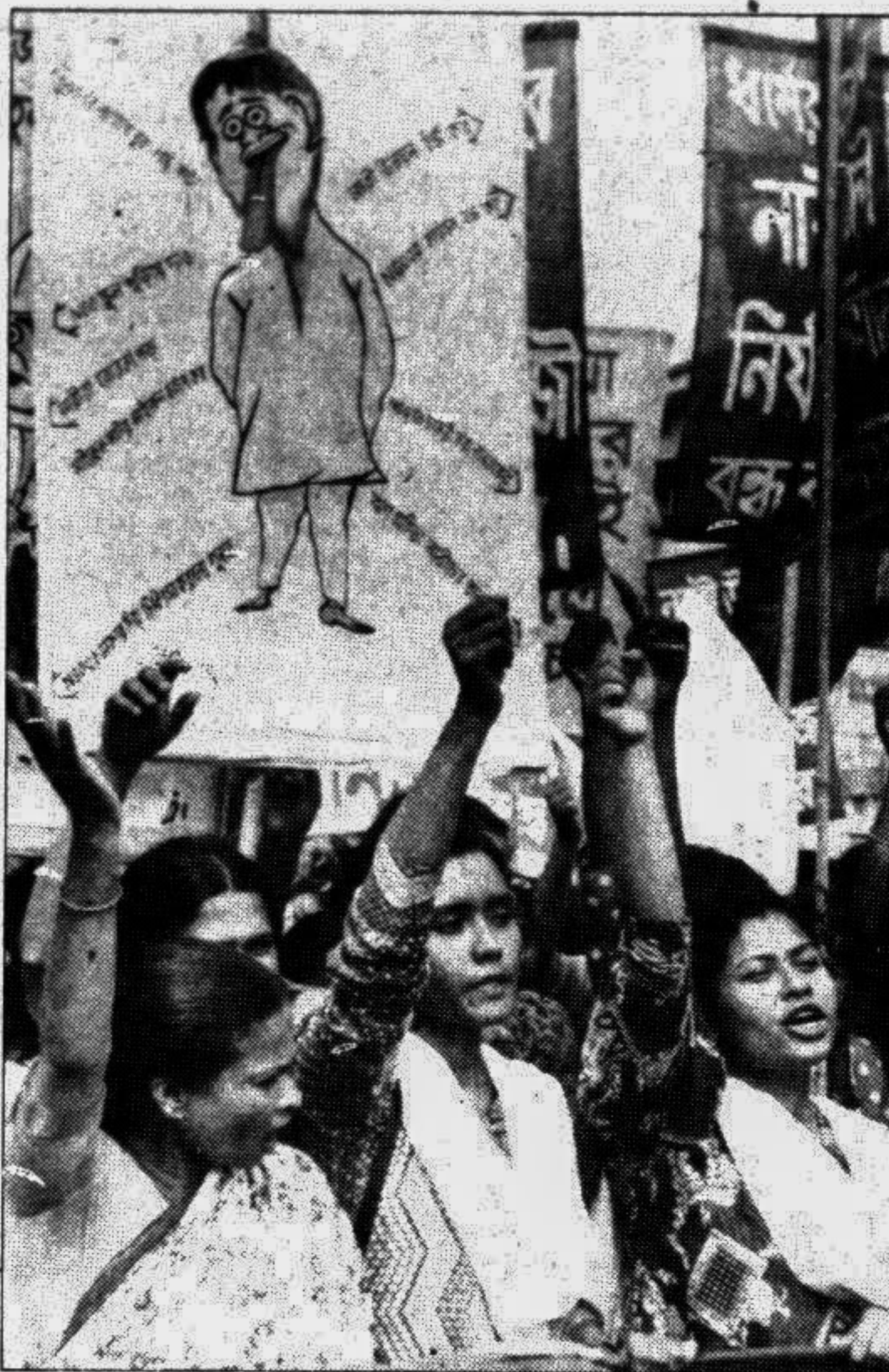
The Women's Development Forum brought out a procession from the city's Bangla Motor area yesterday protesting the illegal and immoral issuance of Fatwa against women.