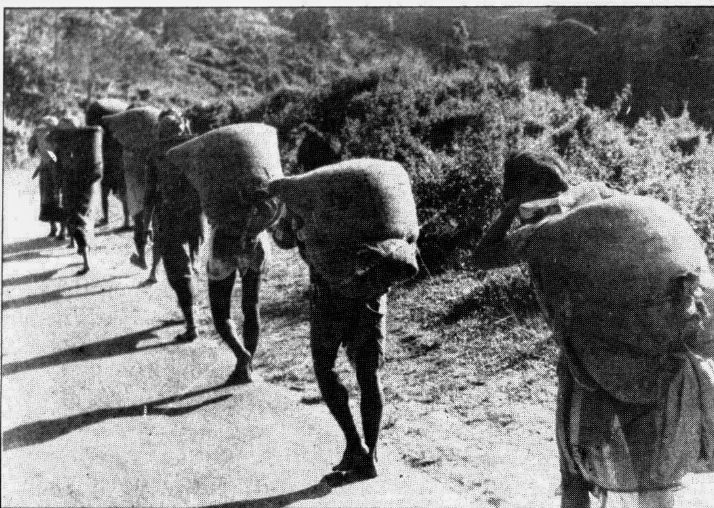
WHEN THE GOING GETS TOUGH: The tribal people of Chittagong Hill Tracts carry heavy goods up and down the hills on their backs the traditional way.

Thousands of passengers have urged the authority to remove the short comings of Kurigram Railway Station.